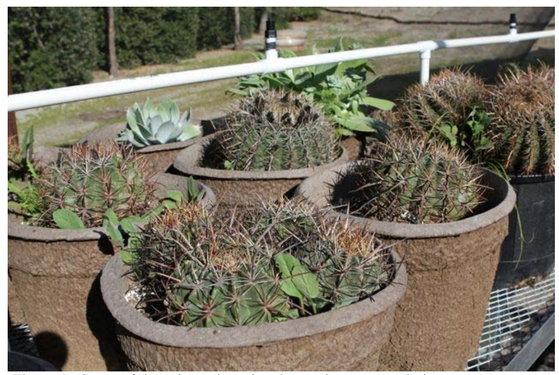
Figure 1. Some of the salvaged cacti and succulents currently in our care.