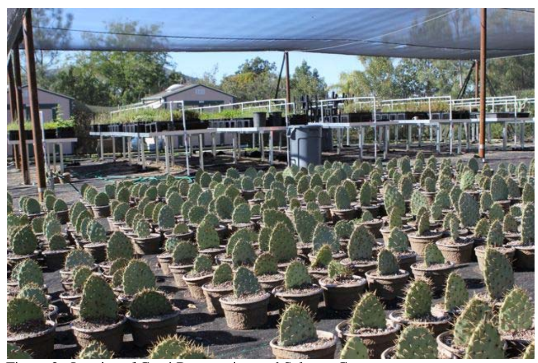
Figure 2. Interior of Cacti Propagation and Salvage Center.