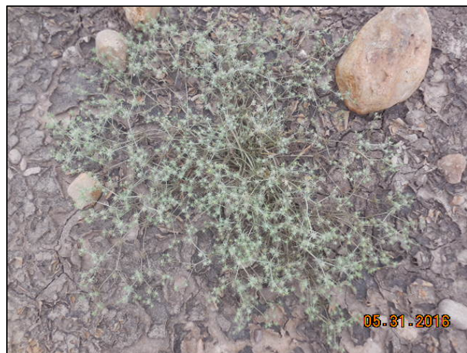
Photo 15. San Diego button-celery ( Eryngium aristulatum var. parishii ), May 2016.