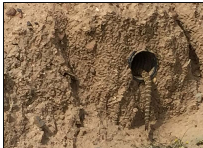
Photo 10. Rattlesnake from Photo 9 entering adjacent tunnel to artificial burrowing owl burrow, April 2016.