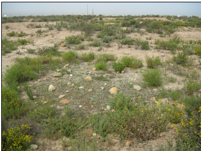
Photo 7. Vernal pool basin with surrounding upland habitat, April 2016.