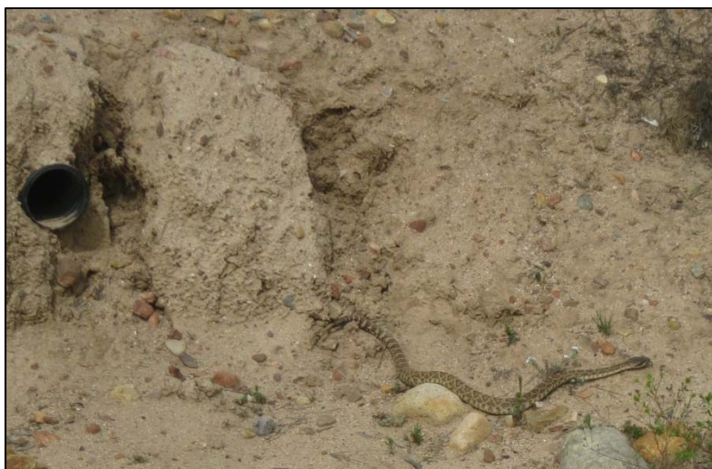
Photo 9. Southern pacific rattlesnake ( Crotalus oreganus helleri ) that recently vacated tunnel to artificial burrowing owl burrow on the left side of the photograph, April 2016.