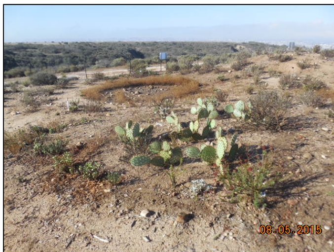
Photo 19. Vernal pools and upland habitat in summer dormancy, August 2016.