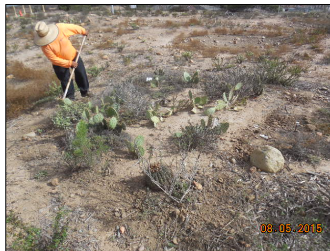
Photo 18. Site maintenance activities, August 2016.