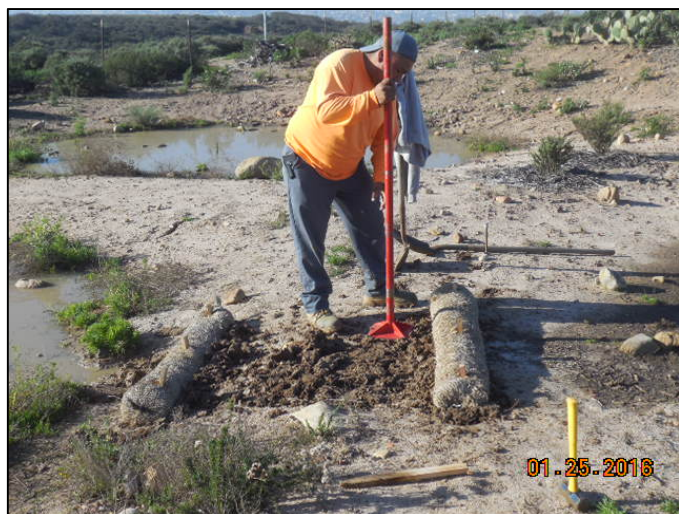
Photo 1. Fixing erosion problem near vernal pools 22 and 23, March 2016.