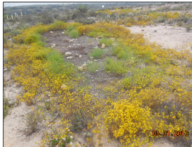
Photo 12. Southern edge of restoration area, facing west, May 2016.