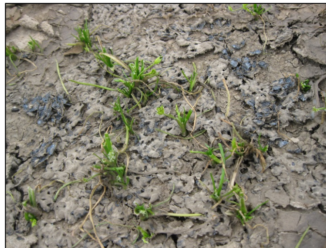
Photo 6. Minor herbivory on flowering quillwort ( Lilaea scilloides ), April 2016.