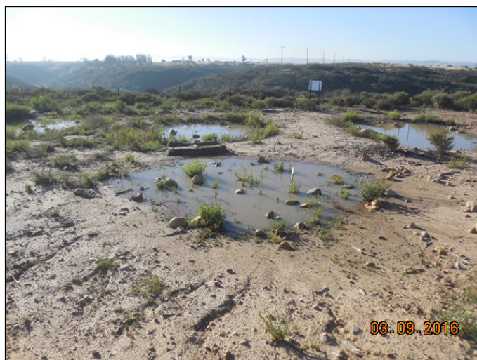
Photo 3. Southeast corner of restoration area, facing east, March 2016.