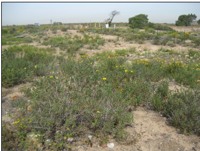
Photo 5. Coastal sage scrub habitat surrounding vernal pool basins, April 2016.