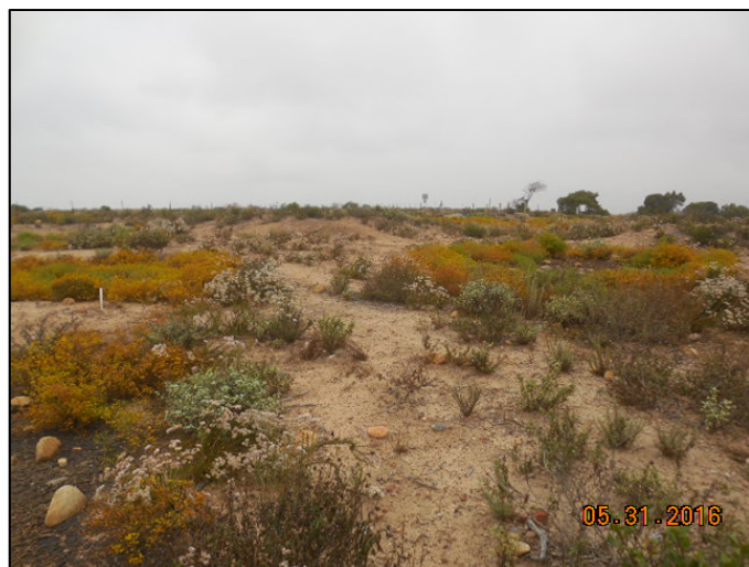
Photo 13. Upland habitat surrounding vernal pool basins, May 2016.