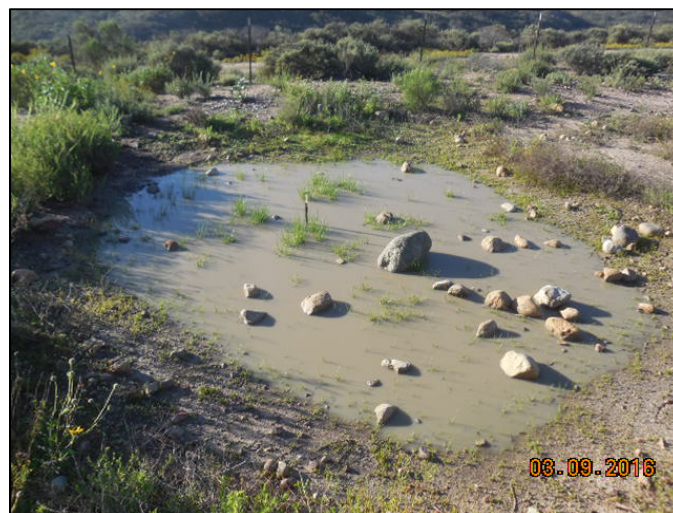
Photo 4. Full vernal pool with flowering quillwort ( Lilaea scilloides ), March 2016.