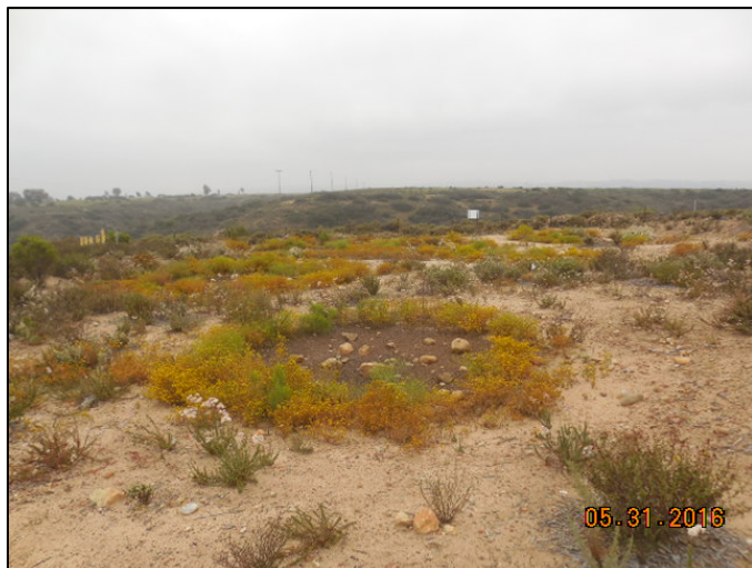
Photo 11. Southeastern portion of restoration site, May 2016.