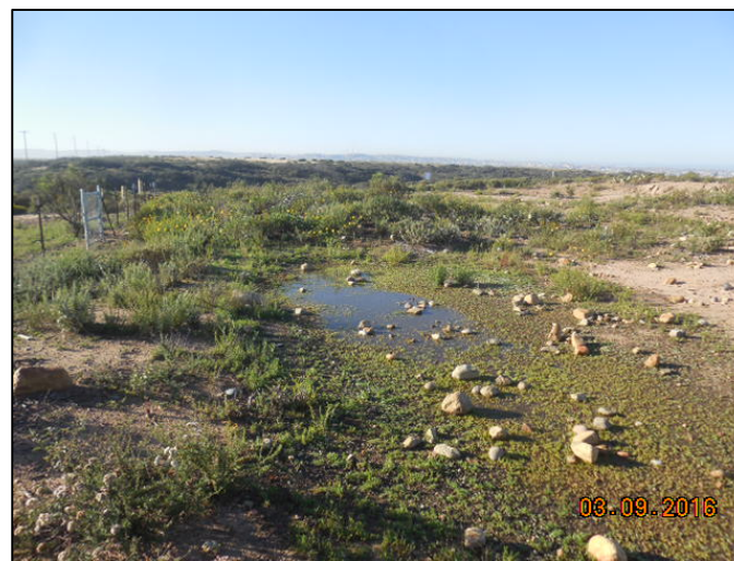
Photo 2. Southern edge of restoration area, facing west, March 2016.