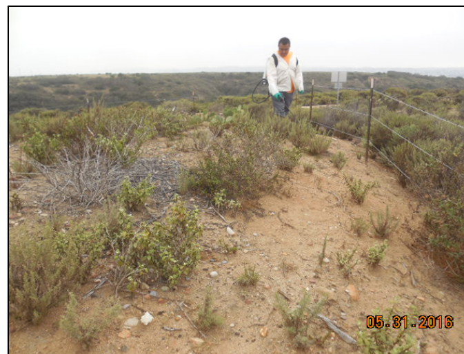
Photo 14. Weed abatement on the restoration site, May 2016.