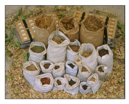
Right: Seed collections in cloth / paper bags

Place collections of dry, ripe seed into cloth or paper bags for transit. Store any awned seed or hooked fruit, that would damage or get stuck in cotton bags, in cardboard boxes or strong paper bags. Never collect or store seeds in plastic bags. Label all seed containers inside and out with a unique collection number, and seal them securely. It is best to prepare sufficient labels before filling the containers.