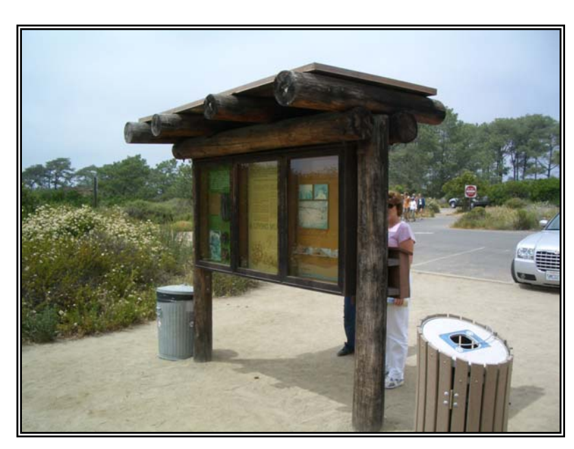
Interpretive Panel at Discovery Trail (West Parking Lot)