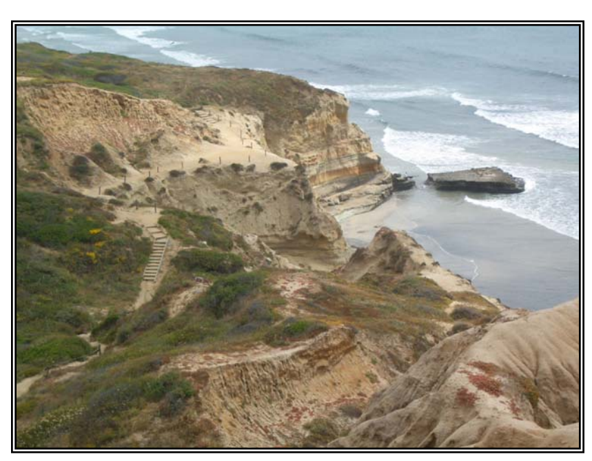
Beach Trail (Terminus)

The terminus of the Beach Trail offers the only beach access from the uplands area of TPSR, and vice versa. For this reason, it is one of the Reserve's most popular trails. The trail's condition has been affected through the years by eroding soils and periods of heavy rainfall. Sloughing of soil materials adjacent to and above the trail has been a perennial problem in keeping the trail maintained and open. The trail terminus has a section elevated approximately 15 feet above the beach that has