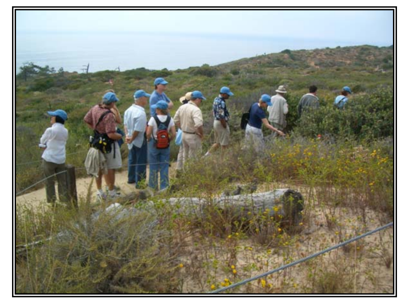
Group tour on Parry Grove Trail

official records have been kept to date documenting numbers of visitors using Reserve trails, informal surveys by staff and docent volunteers indicate an increase in both peak season and non-peak season trail use. This rise in use corresponds to general visitor counts kept by CSP for TPSR. The reason for this increase can most likely be attributed to an increase in the local population and improved freeway access to the coast from outlying regions. The amount of trail use at TPSR has historically been high as compared to less-populated regions in the state and the trend for increased use is likely into the future