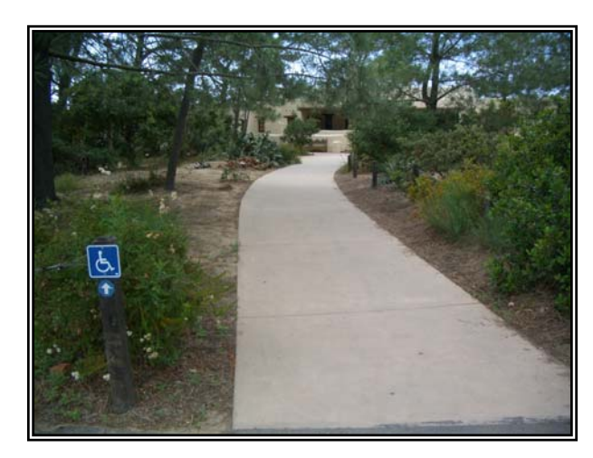
Accessible path from parking lot to visitor center

At present, TPSR is considered a "Level 2" park by the CSP Accessibility Section. This means that according to the Trail Plan for Accessibility in California State Parks (Updated December 2003 CSP Accessibility Section) the goal is to have a minimum of one accessible trail1/2-mile long and one at least 1-mile long. The Discovery Trail satisfies the first goal of an accessible trail 1/2-mile long. The CSP Accessibility Section has developed a long-term funding plan for the construction or adaptation of a 1-mile long accessible trail in the future.