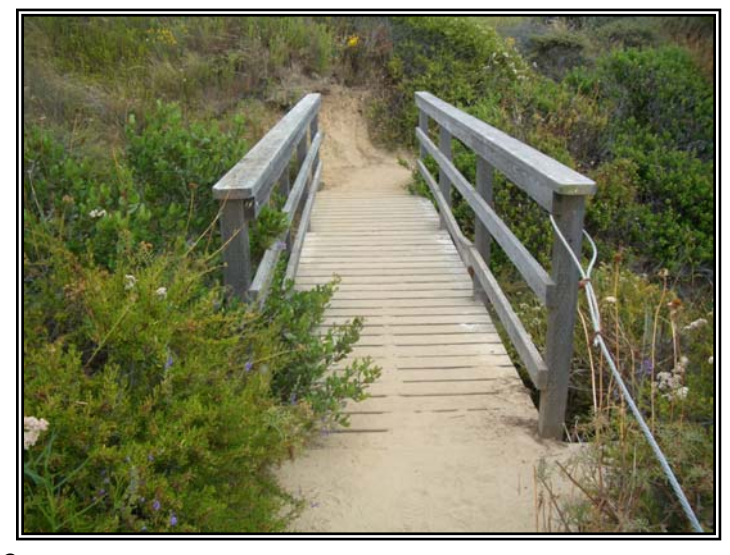
Bridge on Razor Point Trail

trends, and personal tastes. The inconsistency of materials has caused TPSR to lack a cohesive aesthetic theme. In addition, some materials clearly do not complement the natural scenery. Instead, they stand out from it. In general, it is important that trail materials blend to the maximum degree possible with Reserve features so as not to detract from a visitor's experience of the Reserves' natural features. Uncomplimentary or unsightly trail materials can have a negative effect on a visitor's appreciation of Reserve values. Furthermore, it is important to have consistent materials so that a unified image is projected to the public.