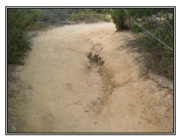
Erosion gully on Beach Trail

Annual trail maintenance is crucial at TPSR because of high use, eroding soils, and poor or lack of initial design of some trails. Trails can quickly become entrenched and act as water courses. Occasionally high winter rainfall can accelerate erosion and lead to gullying of trail surfaces. Annual maintenance can alleviate many of these problems and prolong a trail's durability, as well as avoid future deferred maintenance costs.