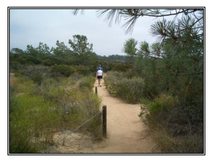
Beach Trail – near West Parking Lot