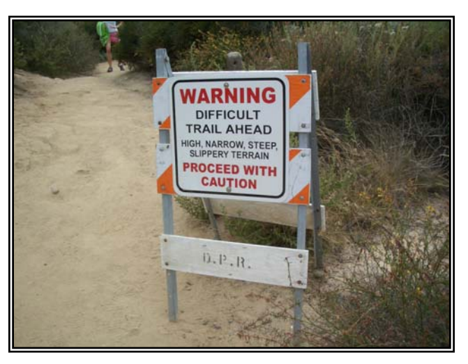
Warning sign on Beach Trail

6.3.1 Develop an inventory-based trail budget to prioritize trail repairs. This inventory shall be based, in part, on the classification and ranking of all trails in the Reserve. This classification system is currently in use on a state-wide basis in CSP. An additional factor in the prioritization of trail repairs shall be the criteria established in Section 6.3.2. Also, utilize the list of trail problems developed by the volunteer trail monitoring program when identifying potential repair and improvement projects (See 8.0).