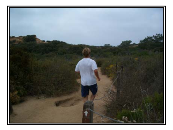
Jogger on upper Beach Trail

disturbed or endangered by runners passing too quickly and/or closely. This can negatively affect other visitor's enjoyment of the Reserve's primary resources. The General Plan recognizes jogging as a use within the Reserve and sets forth the policy that it is appropriate only on designated roadways and roadside shoulders. In addition, the General Plan sets forth the policy that, "The Department shall also eliminate any recreational activity from taking place in the Reserve which is an attraction in itself and which does not directly enhance the enjoyment of the Reserve's primary resources."