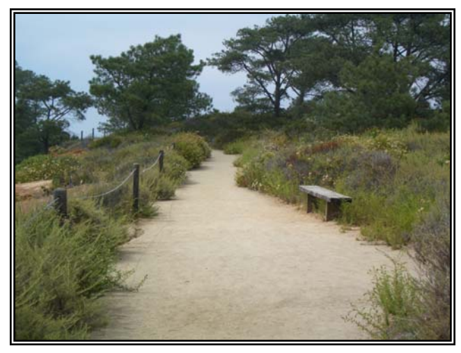
Discovery Trail - West Side