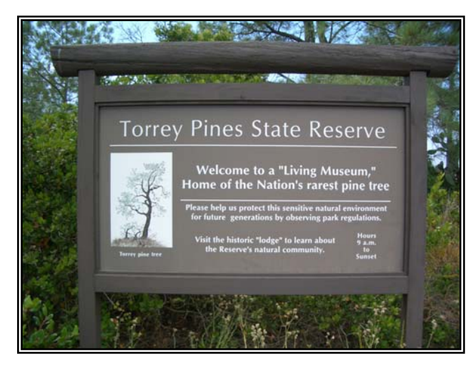
Welcome sign at visitor center

functioning native ecosystems along the coast of northern San Diego County. It has been described as a "wilderness island surrounded by an urban sea." The approximately 1,461-acre Reserve is a place of outstanding scenic beauty as well as a vital sanctuary for native flora and fauna, and historic and archaeological resources. TPSR is home to the rarest native pine tree in North America - the Torrey Pine (Pinus torreyana). Each year up to a million visitors come to enjoy TPSR; most of whom utilize the approximately 9 miles of trails that function as the primary visitor amenity and is the only first-hand way to explore the Reserve (see Figure 1).