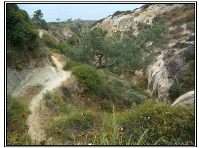
Canyon of the Swifts Trail

A portion of the trail has an elevated wood deck that is in disrepair and the retaining wall near its footings has failed, compromising the structural integrity of the deck. The trail is located