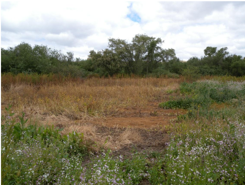
Perennial Pepperweed in San Marcos post treatment