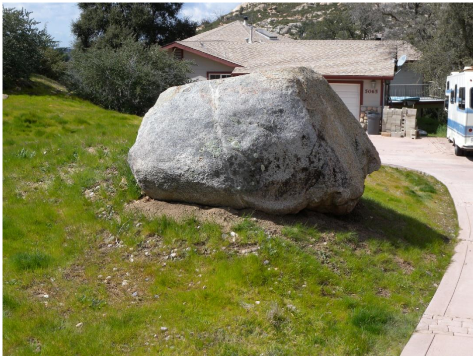
Post Treatments of Yellow Starthistle at Wynola Estates 2011