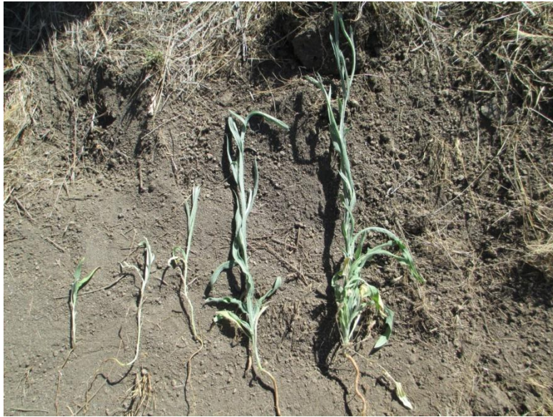
Various sizes of Yellow Starthistle plants found on one site