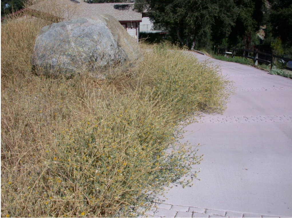
Pre Treatments of Yellow Starthistle found at Wynola Estates