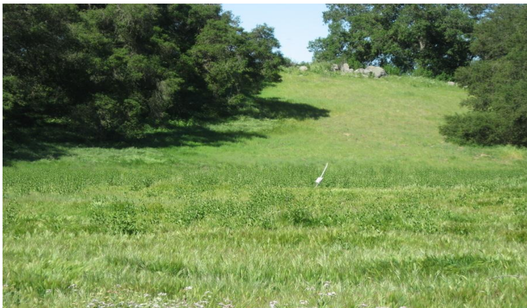
Perennial Pepperweed Infestation at El Modeno