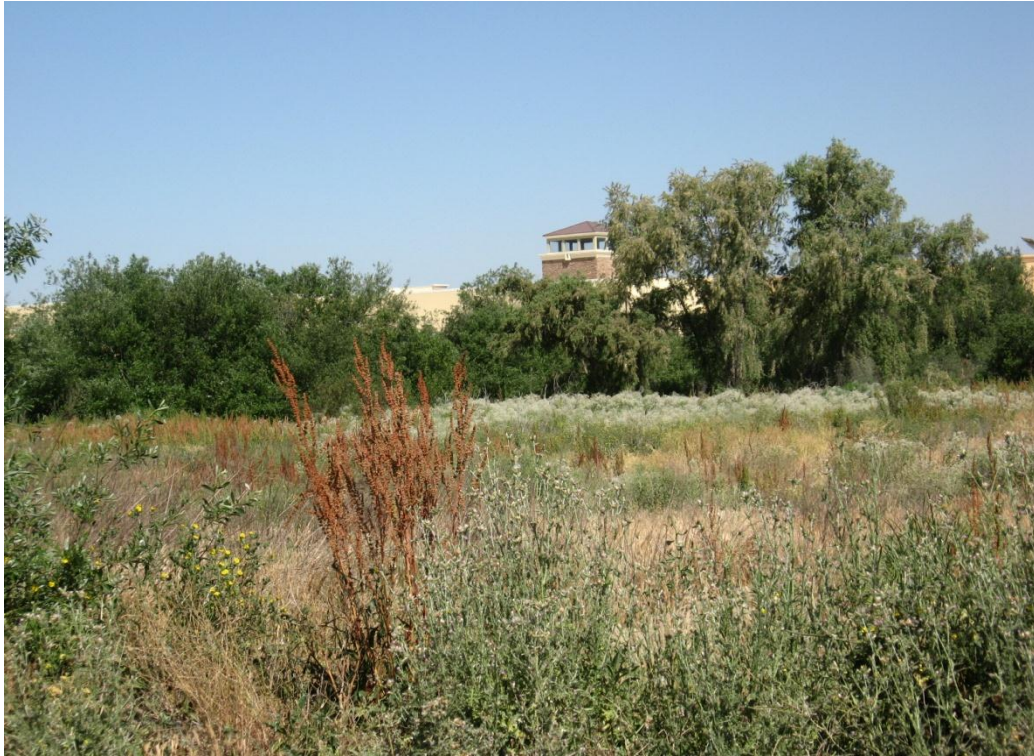
Perennial Pepperweed in San Marcos pre treatment