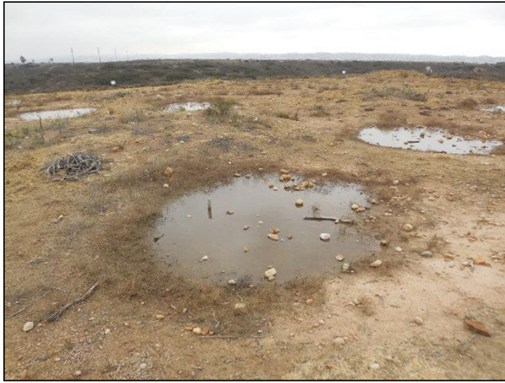
Vernal Pool Restoration Area, March 2014