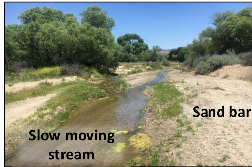
Slow moving stream