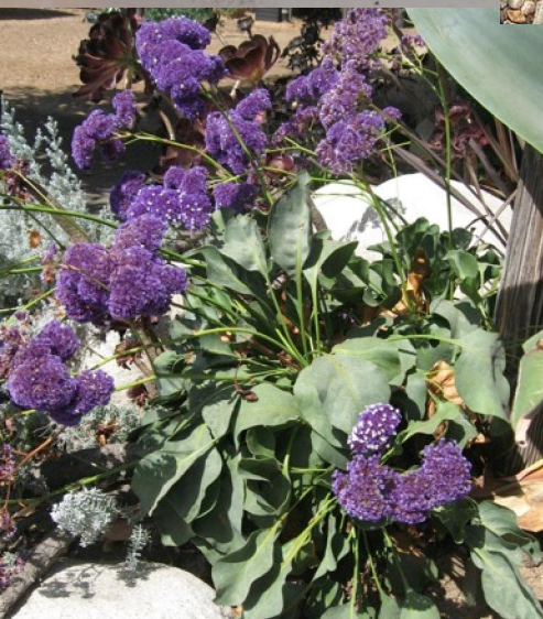
Perez's sea lavender or statice

California sea lavender ( L. californicum ): (native) overall about twice the size of Algerian SL, has larger longer leaves , blade 2–6" (5–15 cm) long, ½–2" (1.5–6 cm) wide, and very spatulate (narrow then abruptly wider). Flowers small and delicate like Algerian sea lavender, but corolla blue.