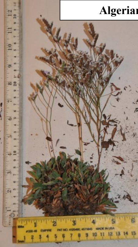
Algerian sea lavender