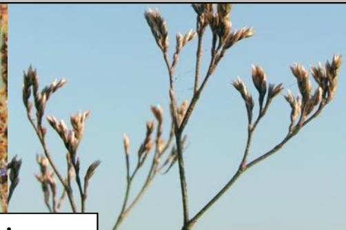
California sea lavender (native)