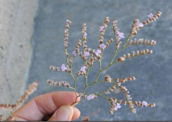
European sea lavender