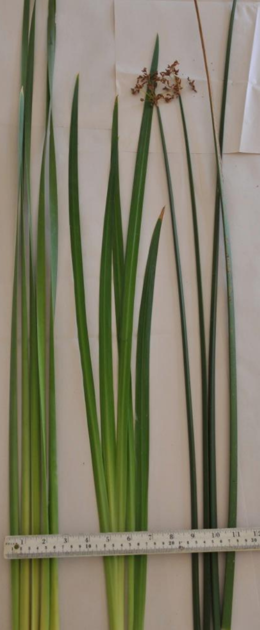
Left to right: Cattails, Yellowflag Iris, and Bulrushes