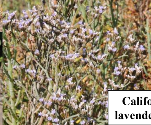
California sea lavender (native)

Plants SIMILAR TO: Algerian Sea Lavender ( Limonium ramosissimum ) European sea lavender ( L. duriusculum ): ( non-native ) has smaller more rounded leaves and flowers are evenly spaced along branch (see other ID sheet: PLEASE MAP). Perez's sea lavender or statice ( L. perezii ): (common non-native used in landscaping) large plants with longer, wider, & bright green leaves 1½–6" (4–15 cm) long, 1–3" (2.5–7 cm) wide, large showy flower clusters. California sea lavender ( L. californicum ): (native) overall about twice the size of Algerian sea lavender, has larger longer leaves , blade 2–6" (5–15 cm) long, ½–2" (1.5–6 cm) wide, and very spatulate (narrow then abruptly wider). Flowers small and delicate like Algerian sea lavender, but corolla blue .