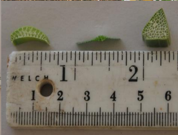
Left to right (cross sections): Cattails, Yellowflag Iris, and Bulrushes