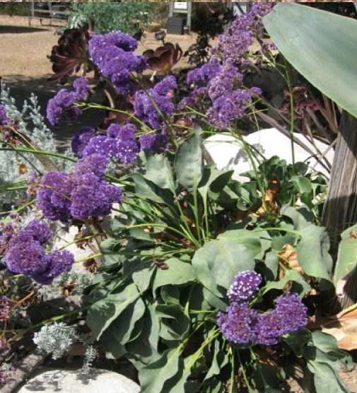
Perez's sea lavender or statice