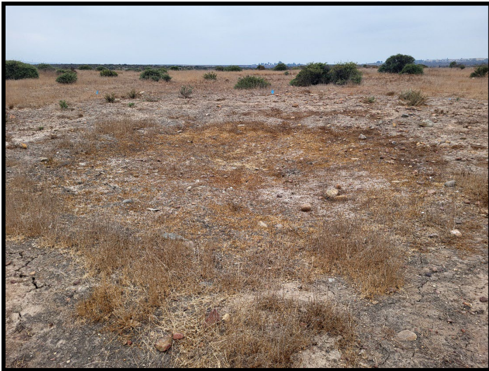
Photo Point 3: 10/15/24 – Looking West. Vernal pool in foreground.