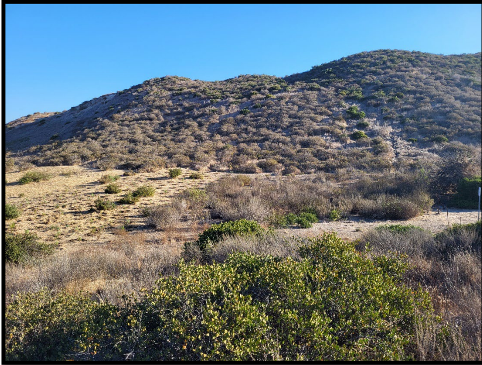
Photo Point 7: 11/3/23 – Looking East. Lower slope plants installed.