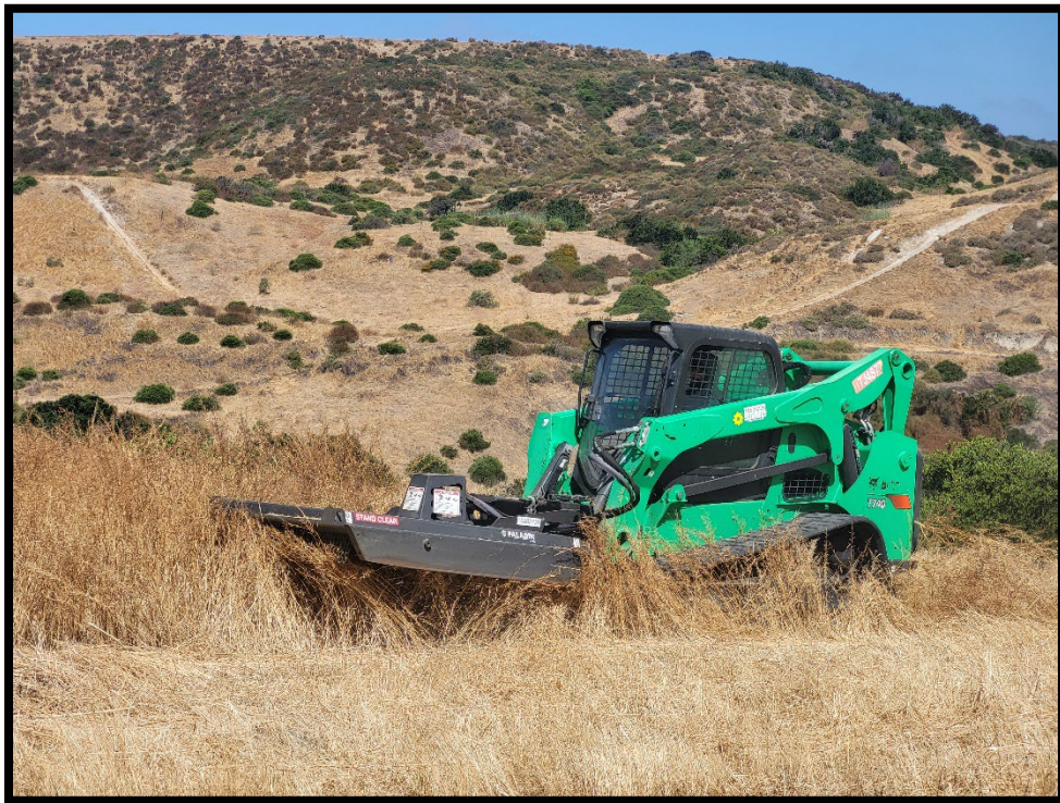
On 6/21/24, 6/25/24 and 6/26/24, City staff performed weed control and watering maintenance in the SW project area.