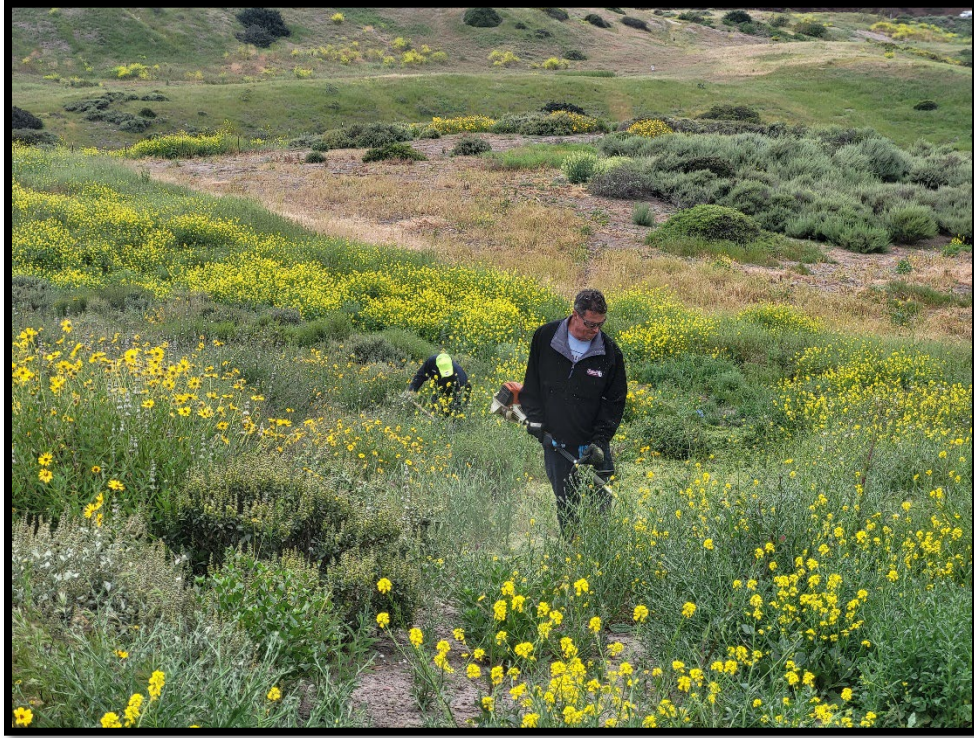
On 4/23/24, City staff performed weed control in the SW project area.