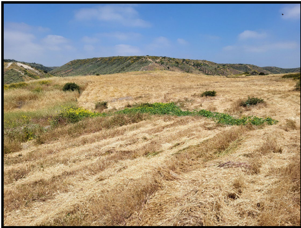
On 4/30/24, City staff performed weed control in the SW project area.