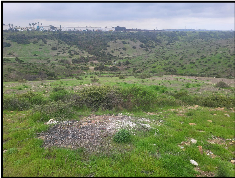
2/29/24 Photo Point 4: 2/29/24 – Looking South.