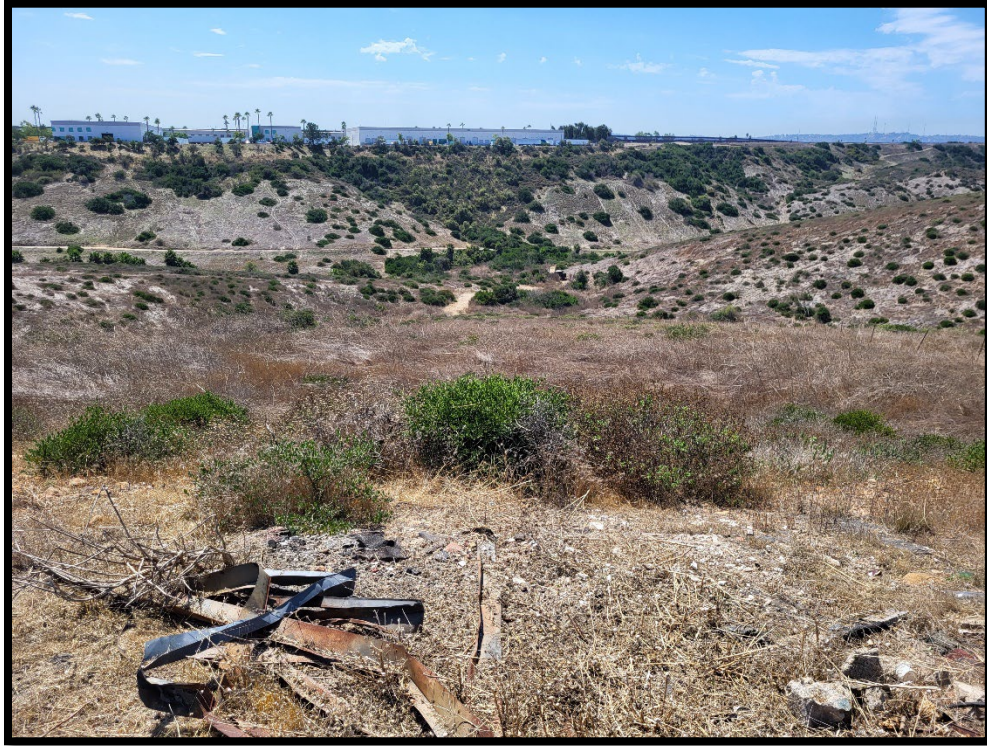
Photo Point 4: 9/8/23 – Looking South. Trash in foreground and weeds on slope.