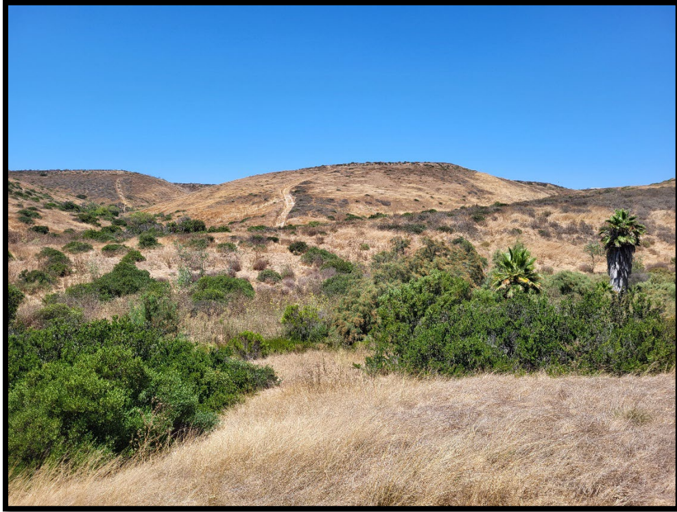
Photo Point 2: 8/3/23 – Looking North. Slope in the background before any work.