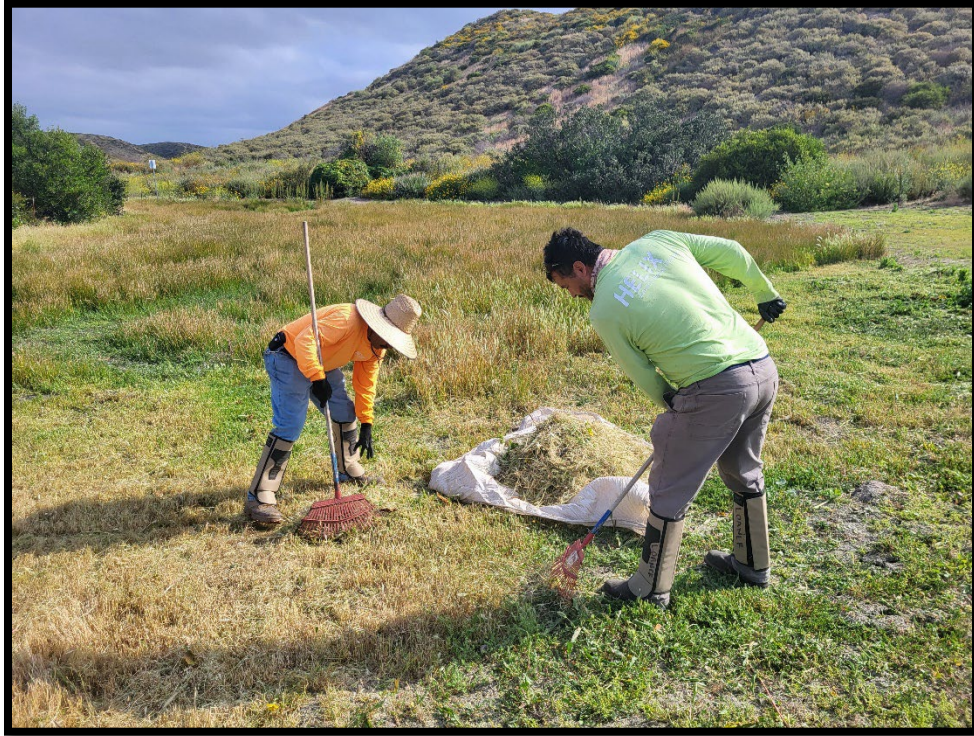
On 5/16/24, Helix Env. performed weed control and dethatch in the SW area.