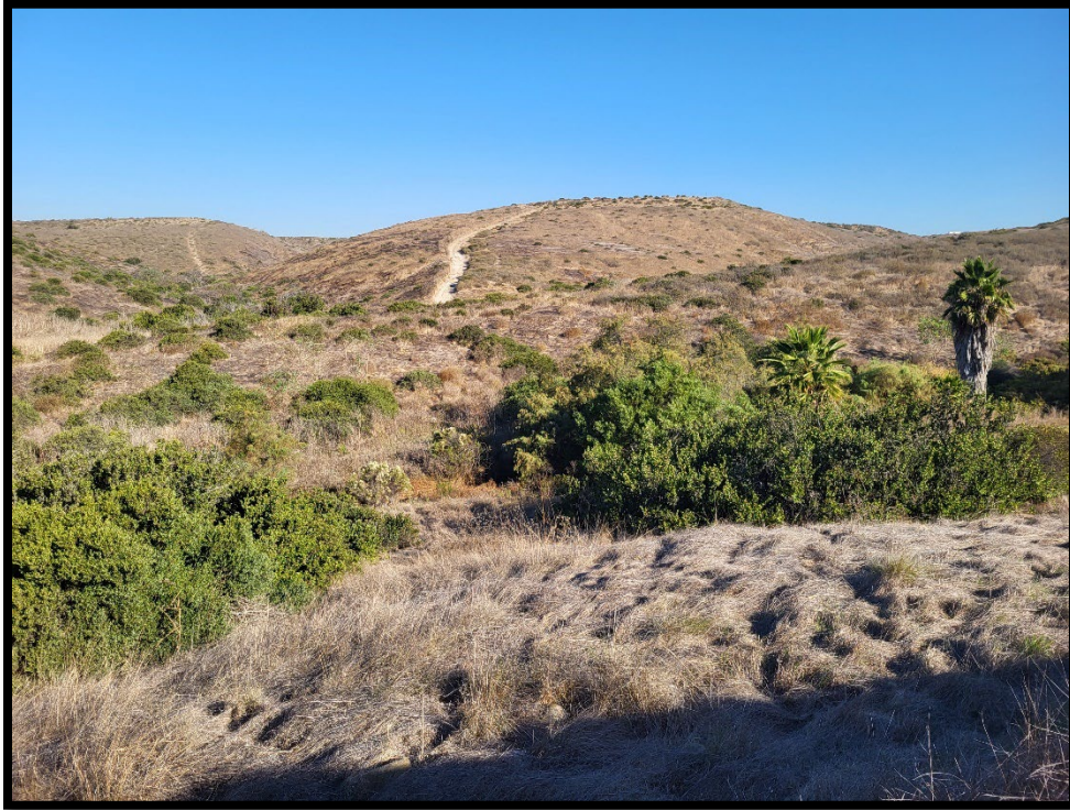
Photo Point 2: 11/3/23 – Looking North. Slope in the background lower portion weed whacked.