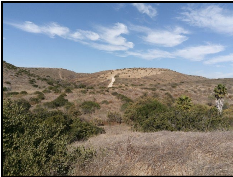
Photo Point 2: 11/14/23 – Looking North. Slope in the background upper portion weed whacked.