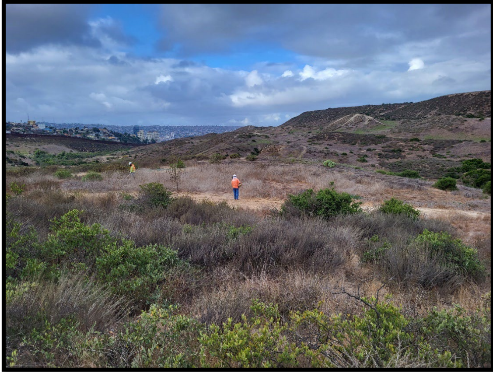
Photo Point 8: 10/23/23 – Looking Southwest. Weed whacking being performed.