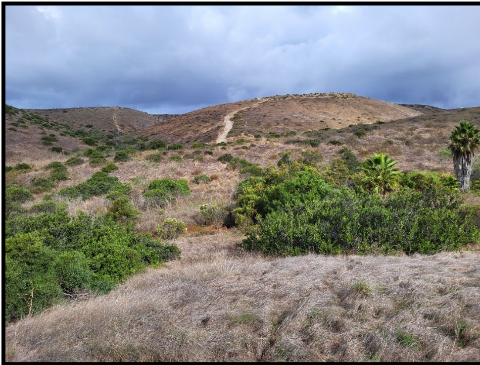
Photo Point 2: 10/23/23 – Looking North. Slope in the background lower portion weed whacked.