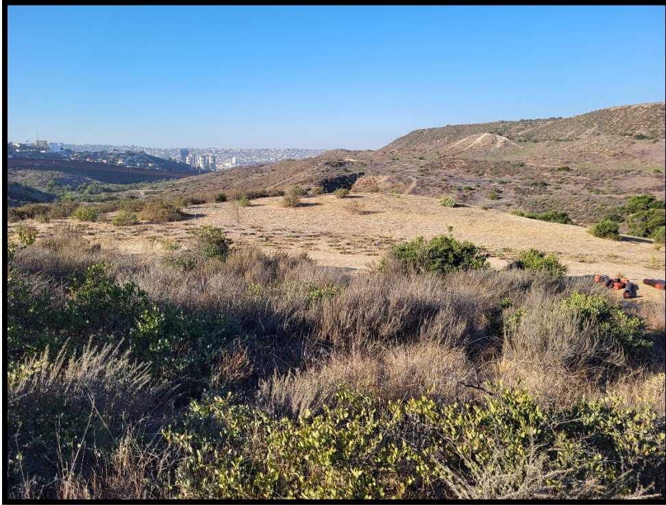
Photo Point 8: 11/3/23 – Looking Southwest. Plants installed with buffer.