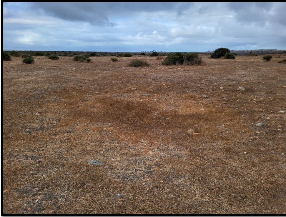
Photo Point 3: 10/23/23 – Looking West. Area around vernal pool weed whacked.