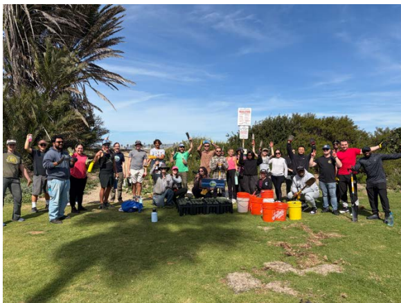
Photos 5-6: Group photos of volunteers before and during Q1 restoration events

The removal work completed this quarter is especially timely as we head into the rainy season where we are starting to see rare native seedlings looking for space and nutrients to establish. These efforts are essential to promoting a more resilient, biodiverse, and functional ecosystem.