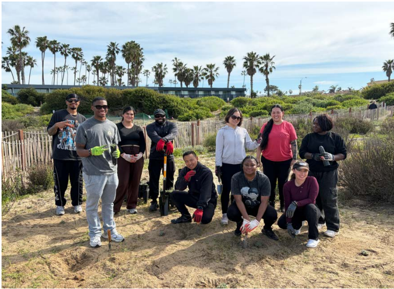
Photos 7-8: Group photos of volunteers before and during Q1 restoration events