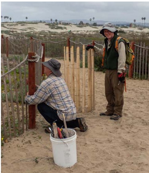
Photos 9-10: Access control fence was maintained by volunteer leaders

As previously reported, installation of new fencing was fully completed in the end of 2025. In this quarter, damaged wooden slats along the existing fence were repaired or replaced on a regular basis to prevent further vandalism and reinforce boundaries, which protects the most sensitive habitat areas (see Photos 9 and 10).