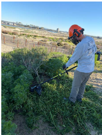
Photos 1-2: Volunteers hand-pulling annual weeds and planting native species..

Primary non-native annual weeds targeted for removal included crown daisy ( Glebionis coronaria ), devil's thorn ( Rumex spinosus ), European sea rocket ( Cakile maritima ), prickly Russian thistle ( Salsola tragus ), in addition to European sea lavender ( Limonium duriusculum ).