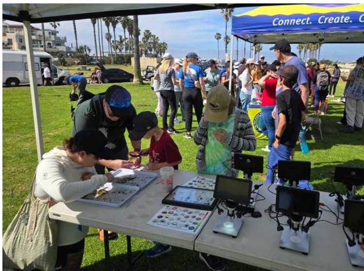
Photos 11-12: Community members learn about the biodiversity that rely on the habitats of the project area

A key focus of both events was protecting vulnerable wildlife, including the Ridgway's rail, western snowy plover and least tern. SDRPF emphasized responsible recreation practices, particularly the importance of keeping dogs under control and on designated paths to prevent disturbance to nesting and foraging habitats. Participants were also encouraged to engage in wildlife observation and identification as a way to build personal connections to the ecosystem. Together, these efforts increased awareness of biodiversity, promoted stewardship, and reinforced the message that while the estuary is a space for all to enjoy, it must be protected to ensure the survival of its most sensitive species (see Photos 11-12).