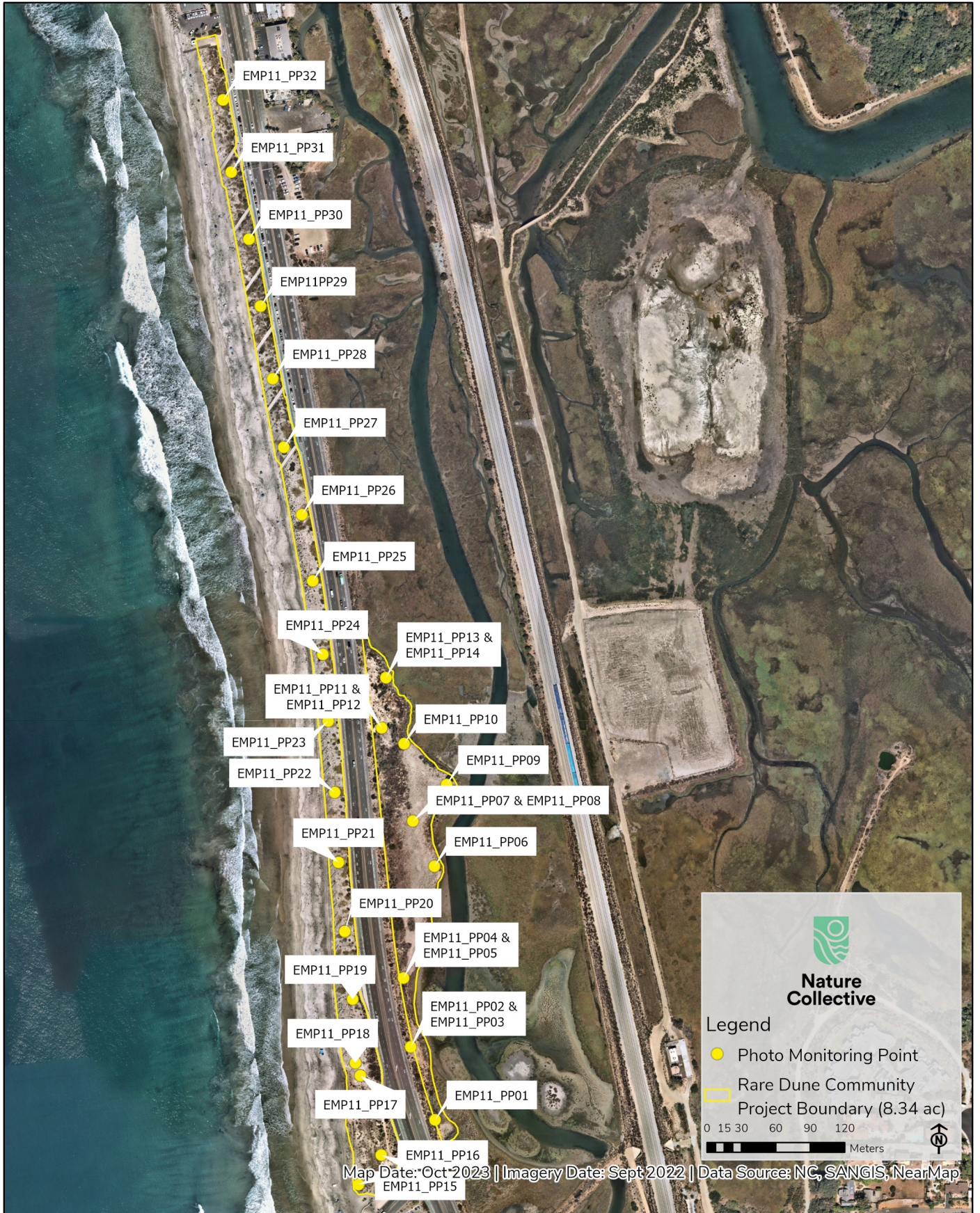
Photo Monitoring Points - September 2023