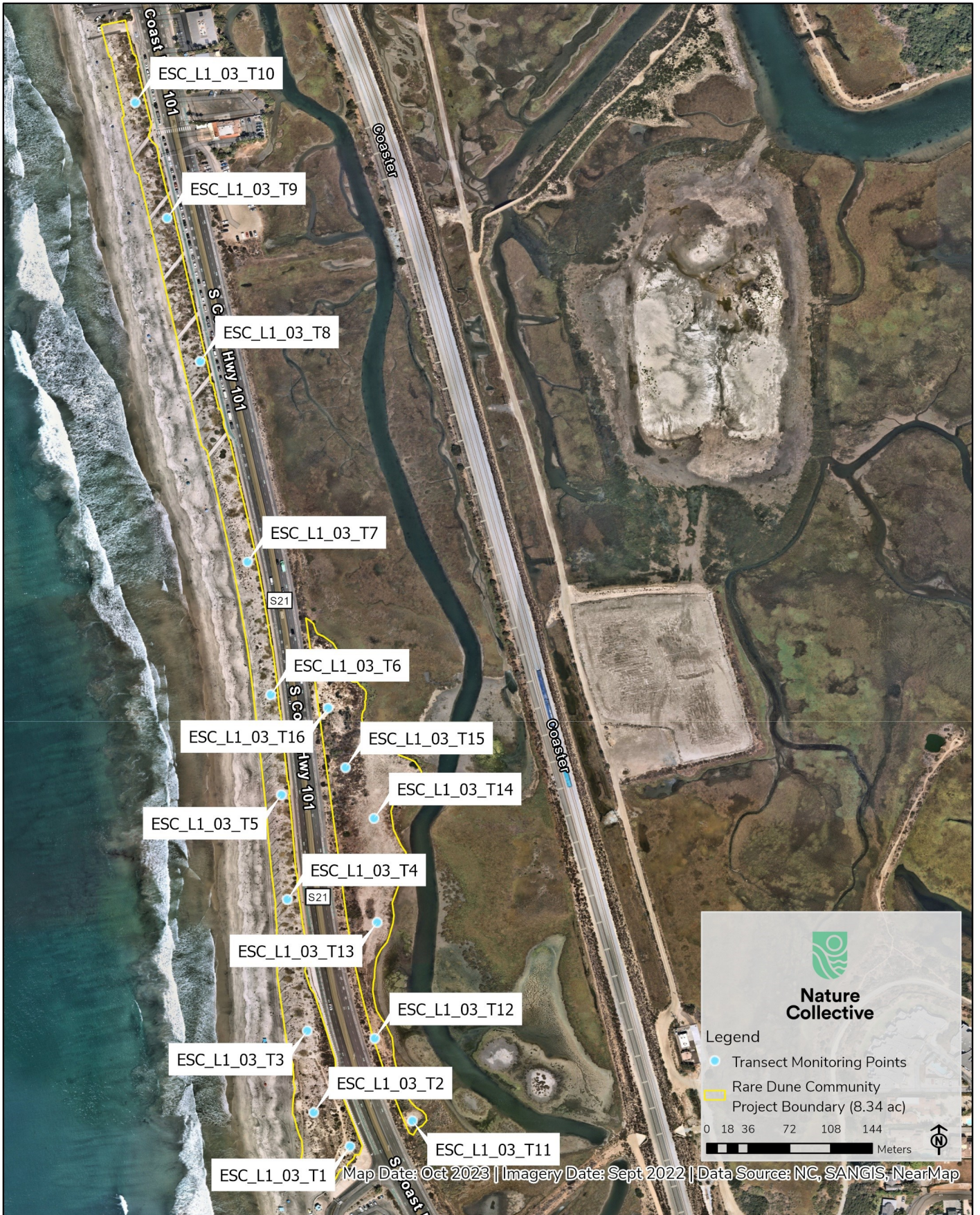
Transect Monitoring Locations - September 2023