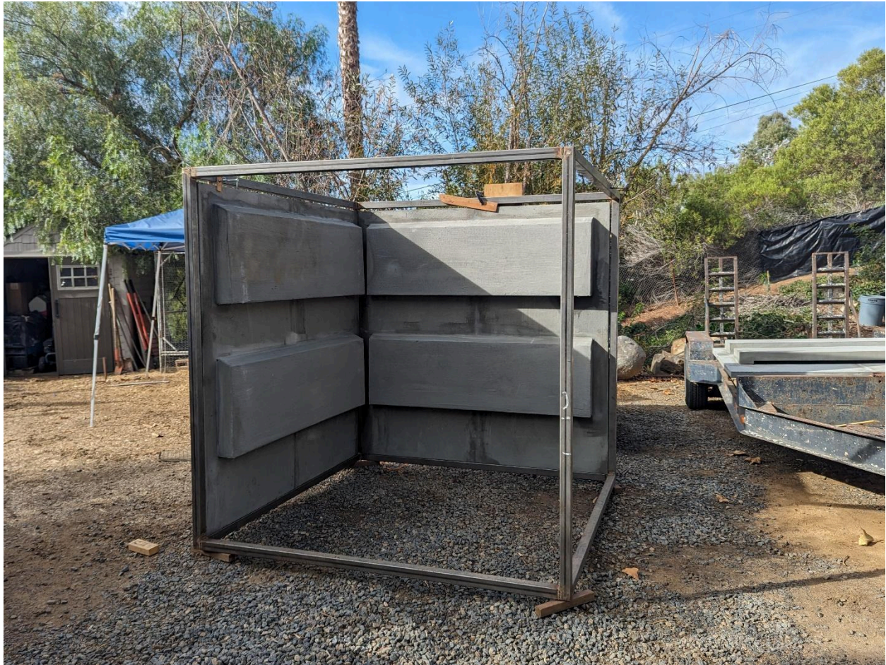
Photograph 3. Bat hotel construction in progress. Construction review meeting at Jim DeBoer's workshop on December 20 th , 2023.