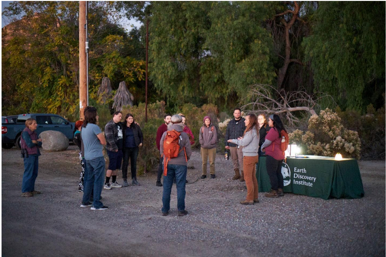
Photograph 1. EDI Conservation Director and participants at the bat outreach event at El Monte Ecological Preserve on the 20 th of November.