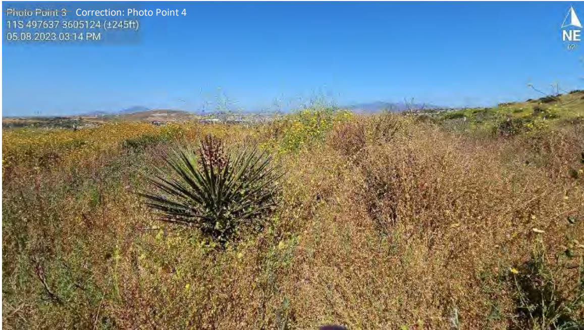
Photo 4.1: Photo point 4 shows baseline conditions for Area 4. Nonnative species cover in Area 4 is estimated at 90%. The most abundant nonnative species include Tocolote thistle, black mustard ( Brassica nigra ), crown daisy ( Glebionis coronaria ), and Mediterranean stork's bill. Note: previous reports incorrectly labeled this as photo point 3.