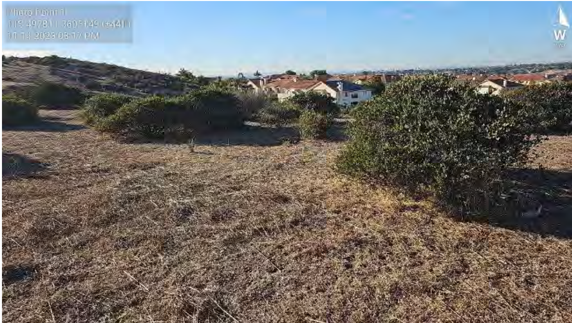
Photo 1.3: Photo point 1 on November 14, 2023. Dethatching of Area 1 occurred on October 4 th and 6 th , 2023.