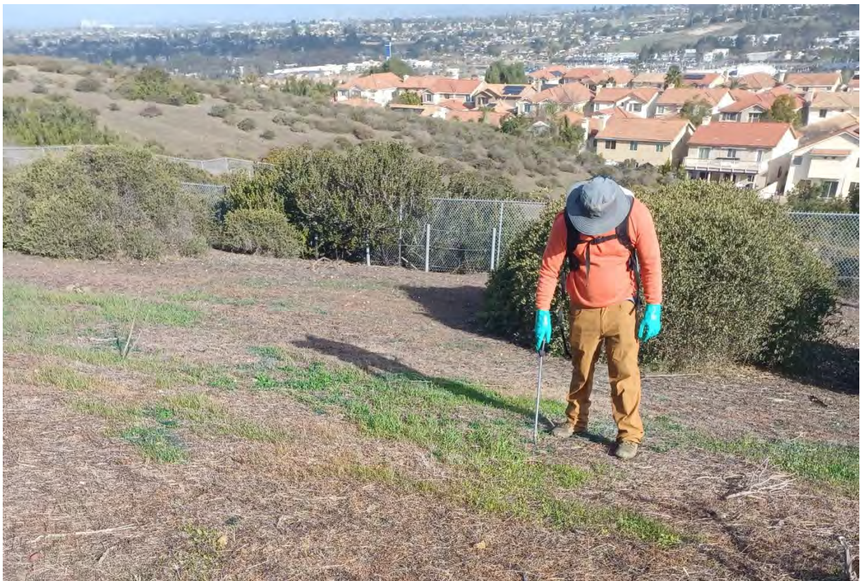
Photo 5.5: Contracted crews performed targeted herbicide applications to control competitive nonnative weeds.