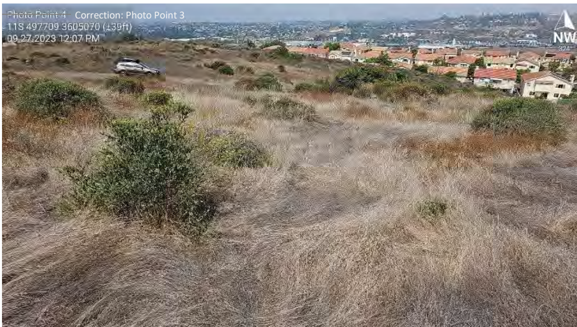
Photo 3.2: Photo point 3 on September 27, 2023. Nonnative species cover in Area 3 is estimated at 85%. Most nonnative species have senesced. Note: previous reports incorrectly labeled this as photo point 4.