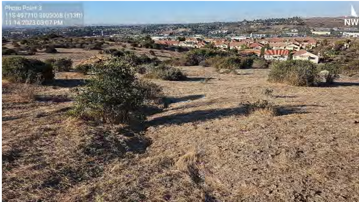
Photo 3.3: Photo point 3 on November 14, 2023. Dethatching of Area 3 occurred on November 1 st , 2 nd and 3 rd , 2023.