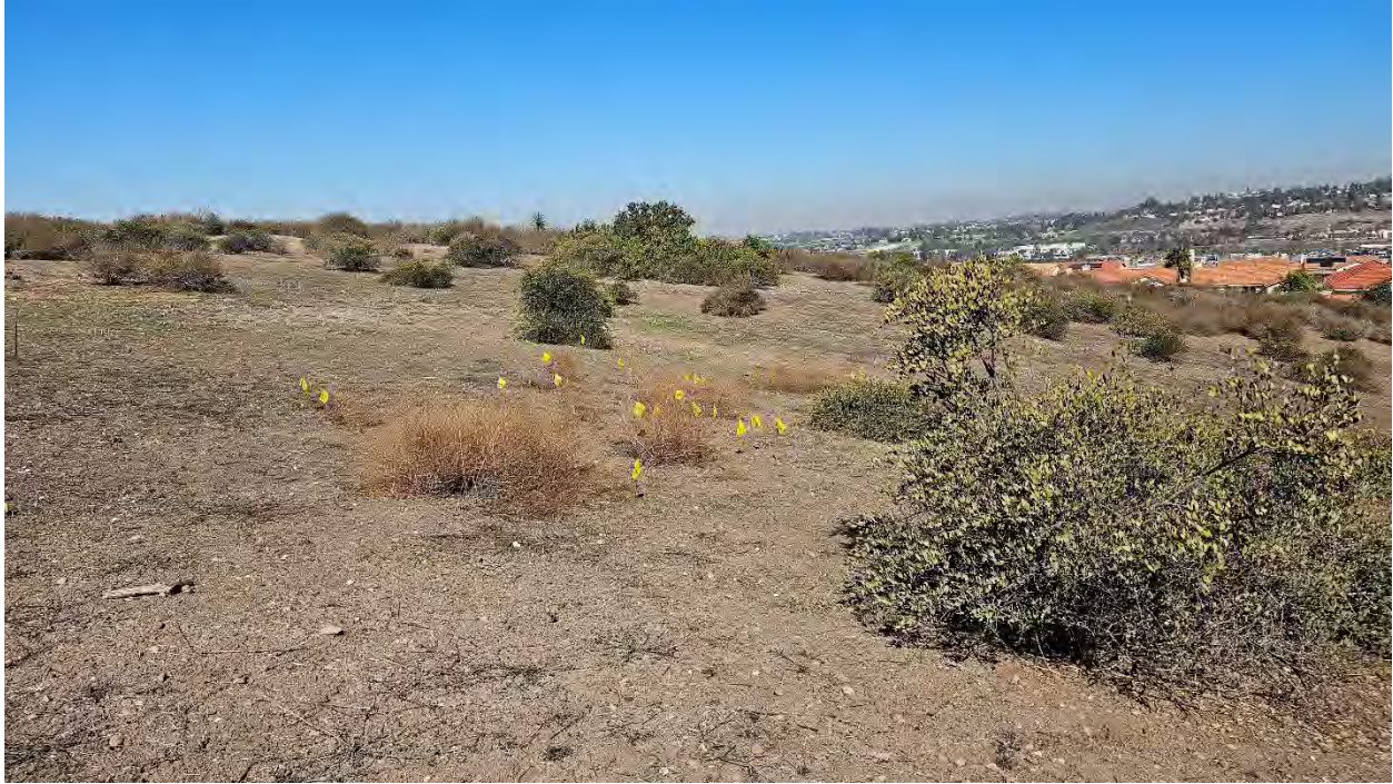
Photo 5.4: Biologists surveyed for Otay tarplant seedlings and marked any observed seedlings with yellow flags.