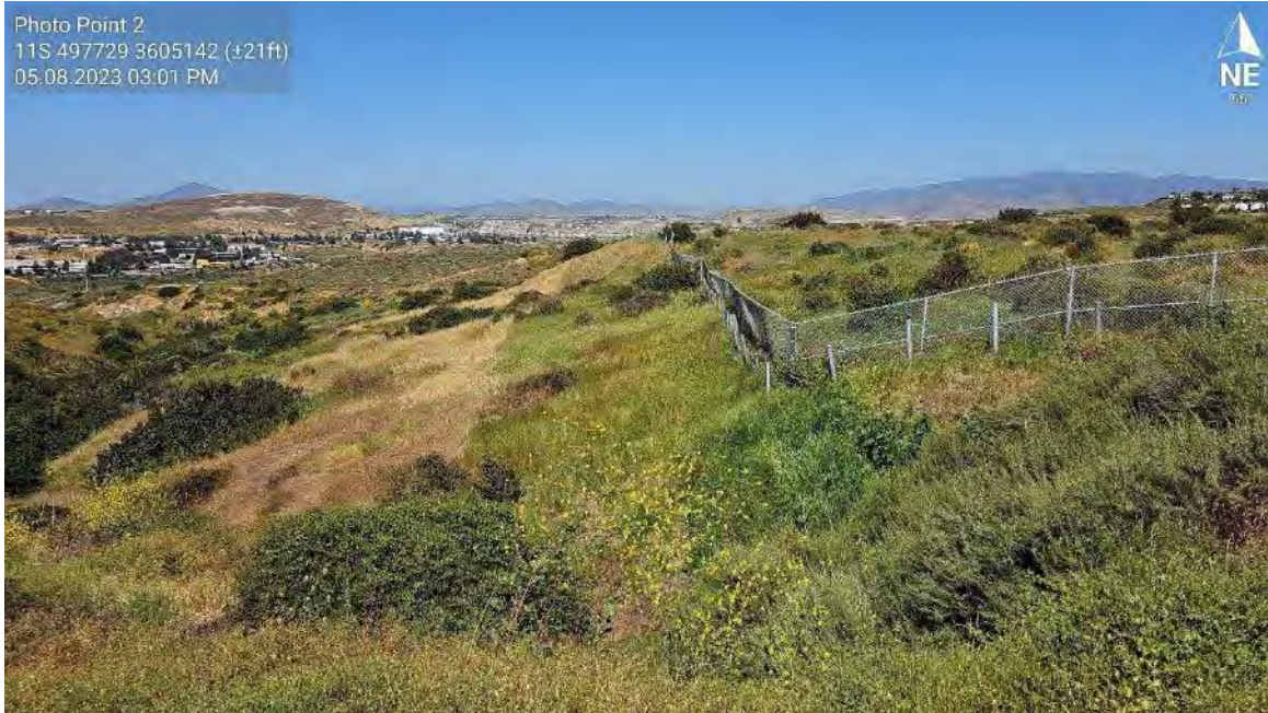
Photo 2.1: Photo point 2 shows baseline conditions for Area 2. Nonnative species cover in Area 2 is estimated at 80%. The most abundant nonnative species include Tocolote thistle, Italian ryegrass ( Festuca perennis ), slender wild oat ( Avena barbata ), and Mediterranean stork's bill.