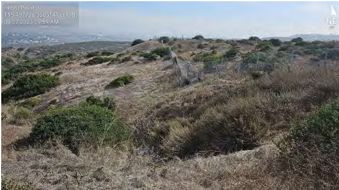
Photo 2.2: Photo point 2 on September 27, 2023. Nonnative species cover in Area 2 is estimated at 80%. Most nonnative species have senesced.