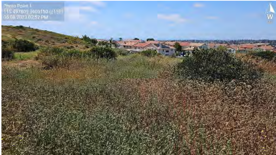
Photo 1.1: Photo point 1 shows baseline conditions for Area 1. Nonnative species cover in Area 1 is estimated at 90%. The most abundant nonnative species include Tocolote thistle ( Centaurea melitensis ), Mediterranean stork's bill ( Erodium malacoides ), Annual yellow sweetclover ( Melilotus indicus ).