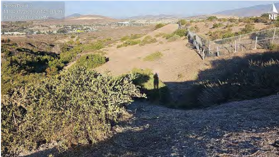
Photo 2.3: Photo point 2 on November 14, 2023. Dethatching of Area 2 occurred on October 18 th and 20 th , 2023.