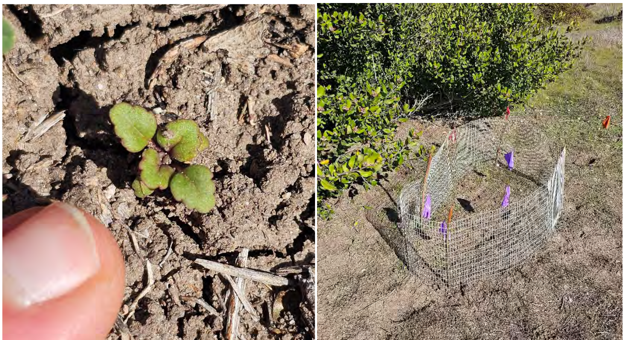
Photos 5.2 & 5.3: Wire herbivore exclusion cages were placed around San Diego thorn mint seedlings to prevent rabbit herbivory.