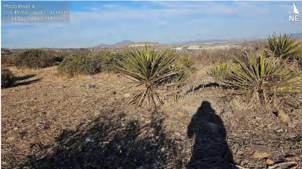
Photo 4.3: Photo point 4 on November 14, 2023. Dethatching of Area 4 occurred on October 25 th , 26 th and 20 th , 2023. Note: previous reports incorrectly labeled this as photo point 3.