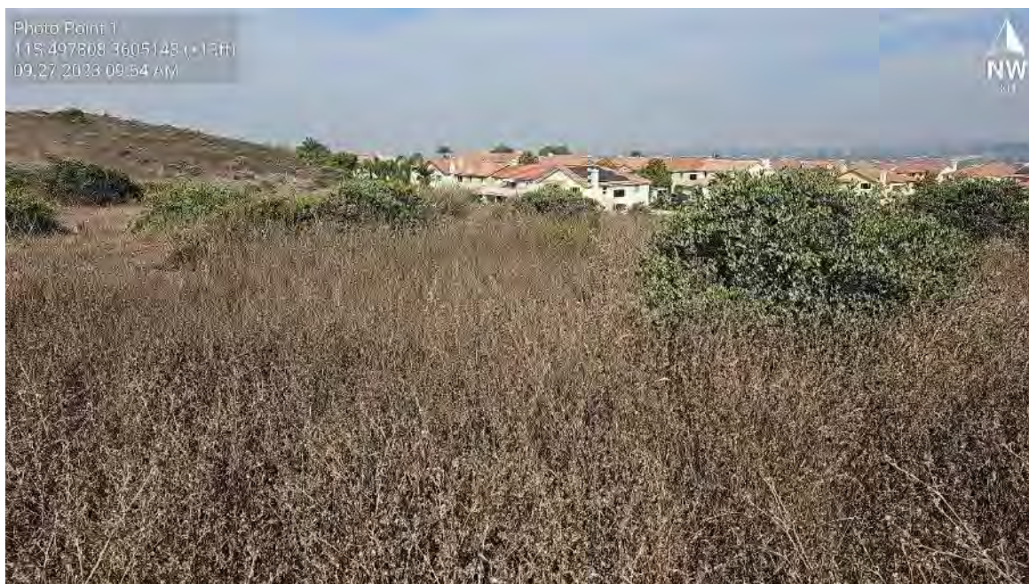
Photo 1.2: Photo point 1 on September 27, 2023. Nonnative species cover in Area 1 is estimated at 90%. Most nonnative species have senesced.