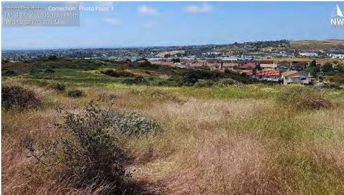
Photo 3.1: Photo point 3 shows baseline conditions for Area 3. Nonnative species cover in Area 3 is estimated at 85%. The most abundant nonnative species include Tocolote thistle, crown daisy, Italian ryegrass, and slender wild oat. Note: previous reports incorrectly labeled this as photo point 4.