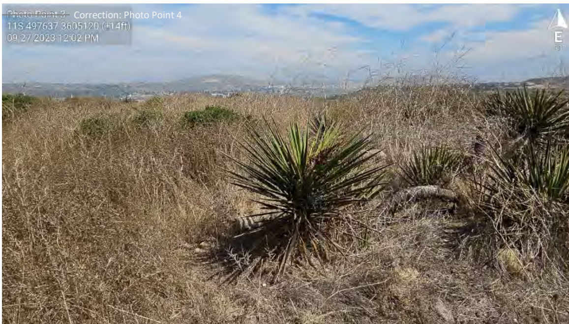
Photo 4.2: Photo point 4 on September 27, 2023. Nonnative species cover in Area 4 is estimated at 90%. Most nonnative species have senesced. Note: previous reports incorrectly labeled this as photo point 3.