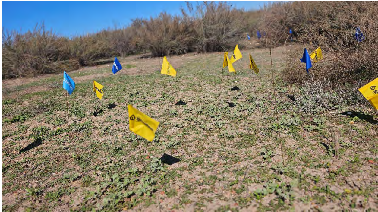
Photo 5.1: Flags marking young San Diego ambrosia plants on March 20, 2025.