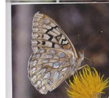
7 Callippe Fritillary (California coast)