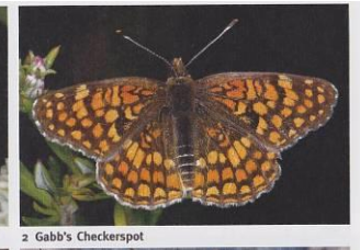
2 Gabb's Checkerspot