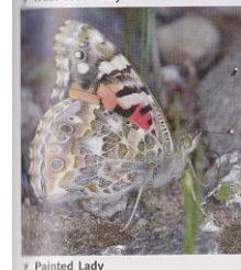
7 Painted Lady

Checkerspots and fritillaries are orange and black, but larger than Hermes copper (especially fritillaries). Both have black in row patterning on upperside and light/silver marks on underside.