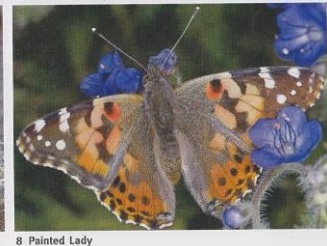
8 Painted Lady

Butterflies of the genus Vanessa (3 possible species) are orange on the upperside but with significant orange on upperside of hindwings. Also note white patches on upperside of forewings. Larger and stronger fliers.