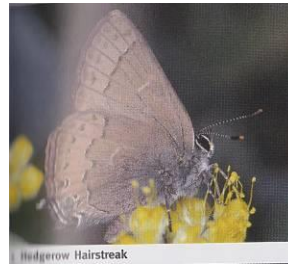
3 Hedgerow Hairstreak

Behr's Metalmark is similar in size and behavior to Hermes copper, but notice the light (metallic-colored) marks. This species is very common.