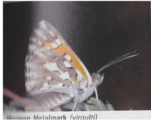
1 Behr's Metalmark ( virgulti )

Hermes copper: when perched usually with wings together (left) but can have wings open (right), especially in morning. Underside mostly light orange with some spots of upper wing visible. Upperside mostly brown with orange in middle of forewing with black spots and orange at base of tails on hindwing.