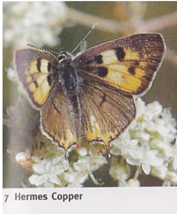
7 Hermes Copper

Hermes copper: when perched usually with wings together (left) but can have wings open (right), especially in morning. Underside mostly light orange with some spots of upper wing visible. Upperside mostly brown with orange in middle of forewing with black spots and orange at base of tails on hindwing.