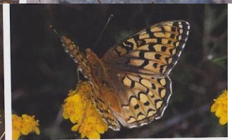
8 Callippe Fritillary ♀ (California coast)

Checkerspots and fritillaries are orange and black, but larger than Hermes copper (especially fritillaries). Both have black in row patterning on upperside and light/silver marks on underside.