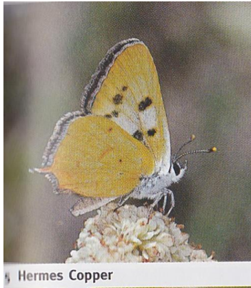
6 Hermes Copper