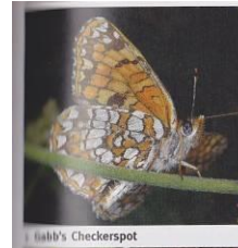
1 Gabb's Checkerspot

Blues are common and slightly smaller than Hermes copper. Gray with black and orange spots on underside, blue (males) or brown (females) on upperside.