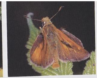
5 Rural Skipper ♂

Some skippers are predominately orange. They have large heads and bodies, and are extremely strong fliers ("zips" around). Can perch with wings together over body (left) or spreadwing (right).