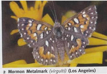
2 Mormon Metalmark ( virgulti ) (Los Angeles)

Behr's Metalmark is similar in size and behavior to Hermes copper, but notice the light (metallic-colored) marks. This species is very common.