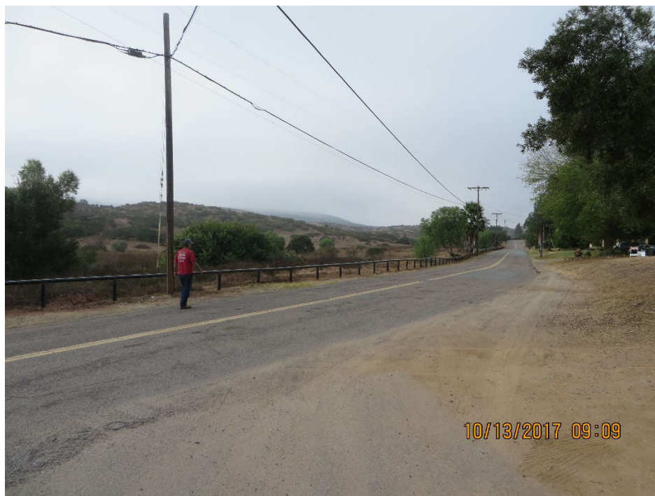
Post-project image at intersection of Pioneer and Proctor Valley Road looking west, showing new ORV barrier installed.