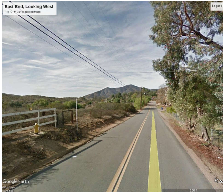
East end of CDFW RJER PV (East Unit) property intersect with private property, looking west. White post is property boundary marker.