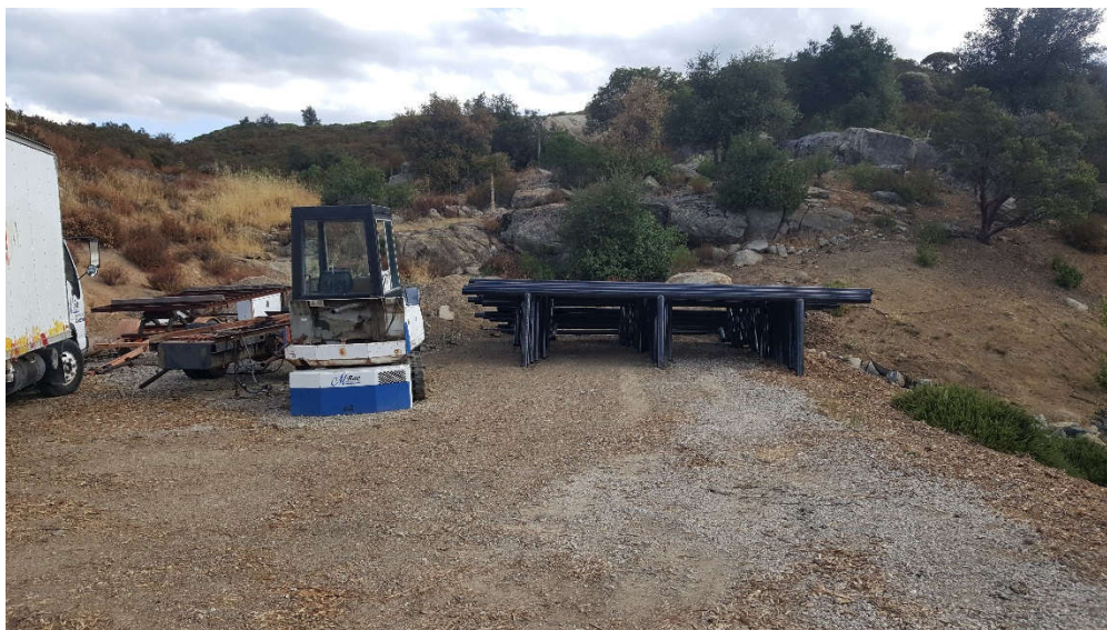
OHV Barrier segments fabricated by CDFW Contractor Sept/Oct 2017