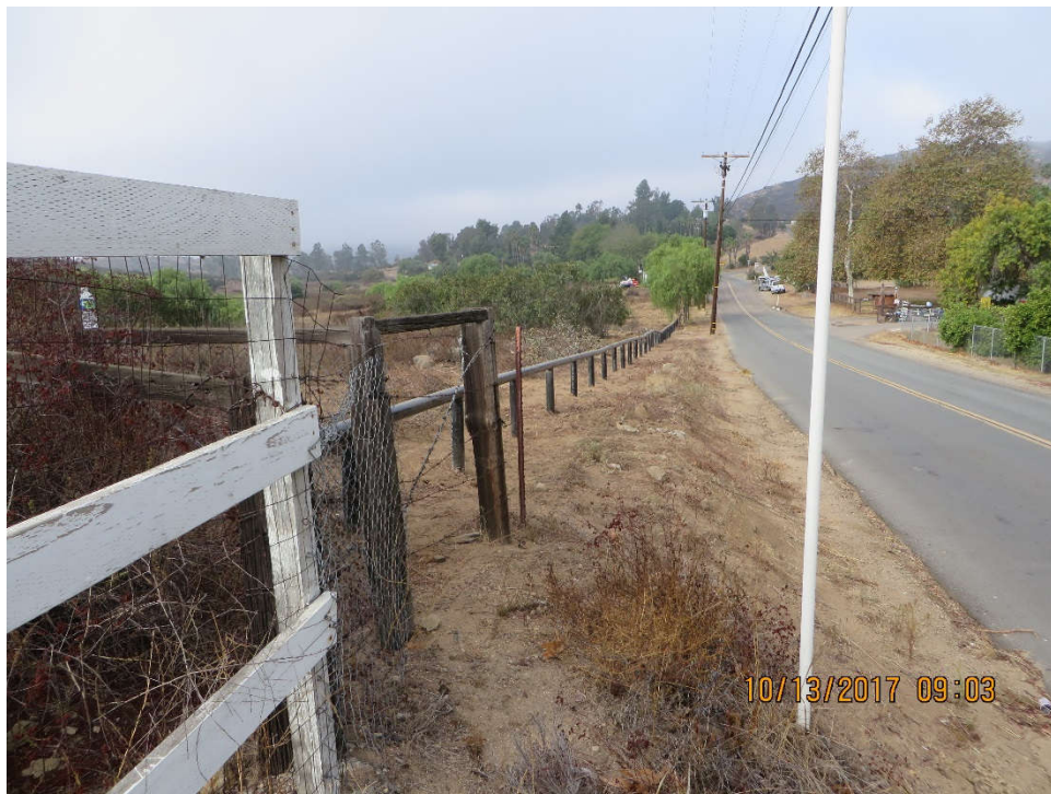
Post Project East End Property at boundary marker, looking west. Contractor equipment in background at CDFW entry gate.