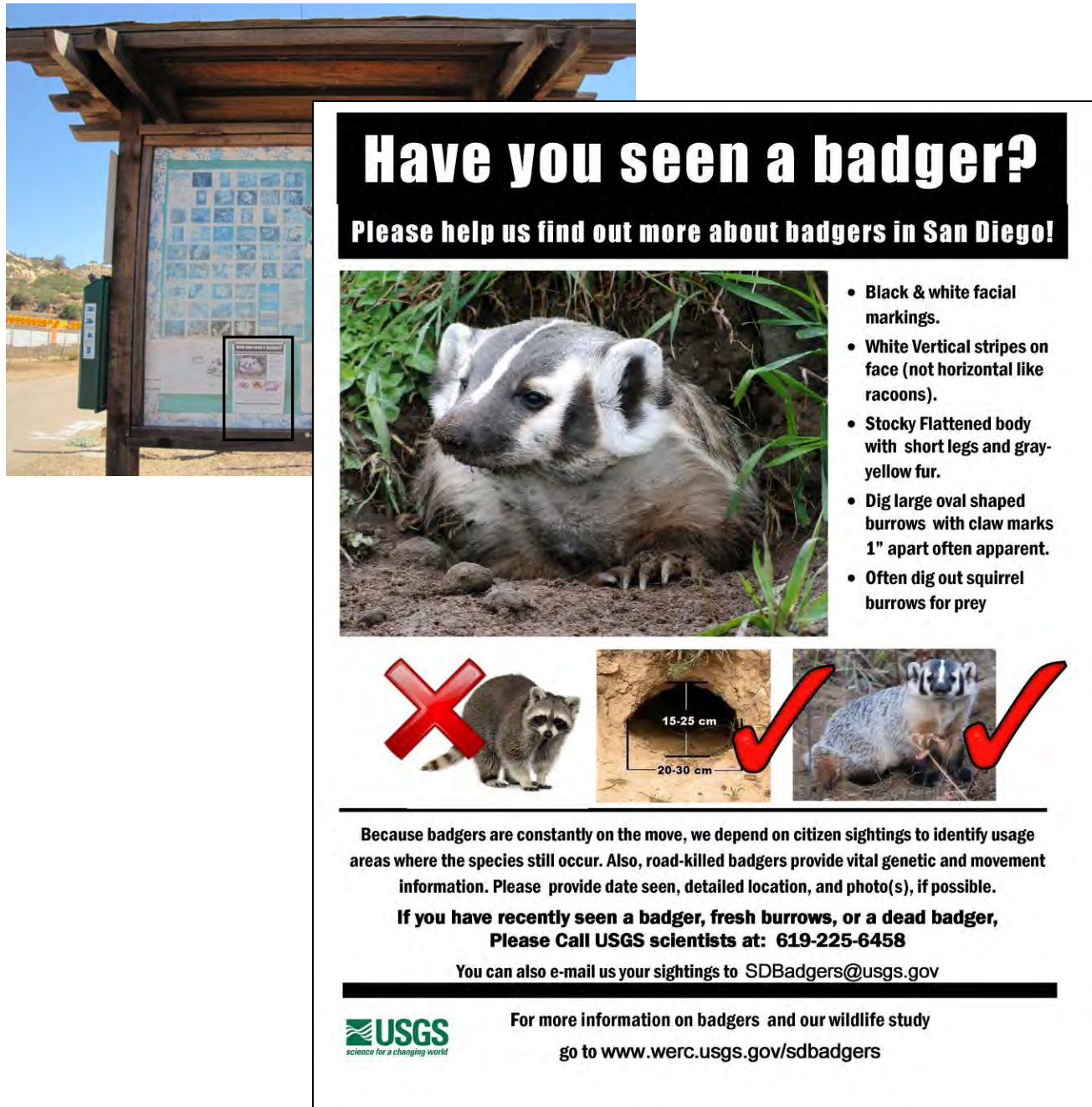
Figure 2. Badger information outreach poster with hotline information (adapted from version provided by Richard Klafki). Example of poster in kiosk at Barnett Ranch Preserve.

efforts as well as posted in information kiosks (Figure 2). We also established a “San Diego Badger Hotline” (phone and email) to collect any sighting information.