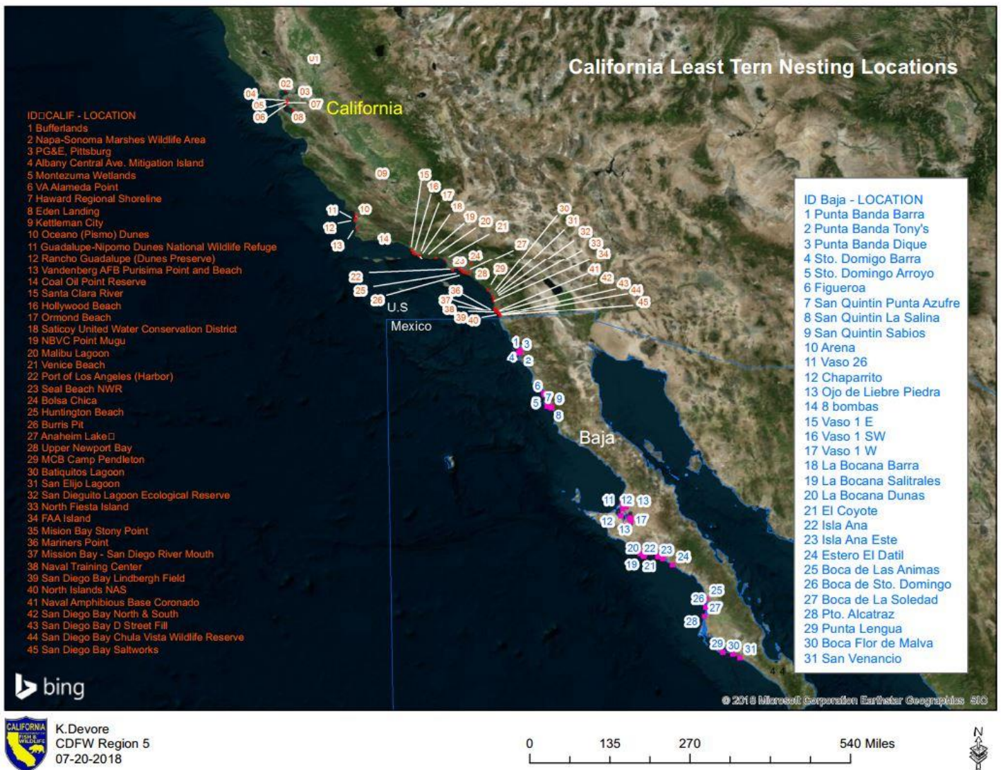
Figure 1. Known nesting sites for the California Least Tern