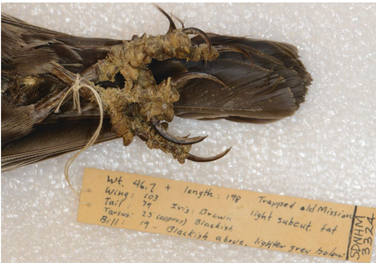
Figure 2. Red-winged Blackbird museum specimen with typical hyperkeratotic lesions due to Knemidokoptes .