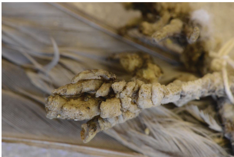
Figure 4. Close-up of the Cassin's Finch specimen showing mite tunnels in the thick keratin layers.