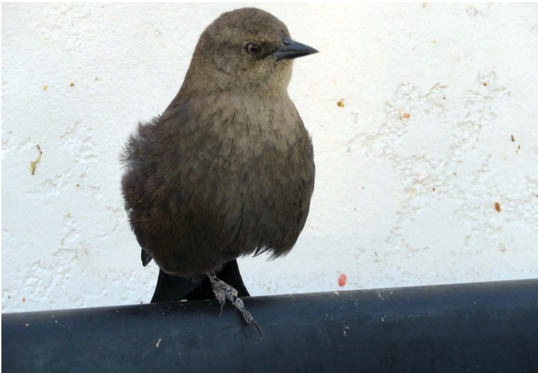
Figure 1. Female Brewer's Blackbird in urban San Diego showing a missing toe and typical hyperkeratotic lesions due to Knemidokoptes .