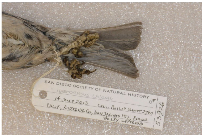
Figure 3. Recent Cassin's Finch museum specimen with hyperkeratotic lesions of Knemidokoptes .