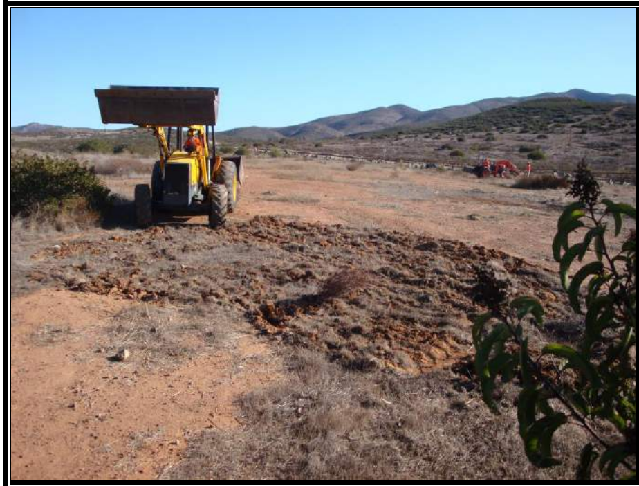
Contractors grading constructed vernal pools.