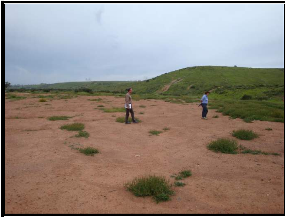
Proctor Valley ORV Site A EMP grant Project site before restoration work. Ground was compacted and bare and green patches were weeds.