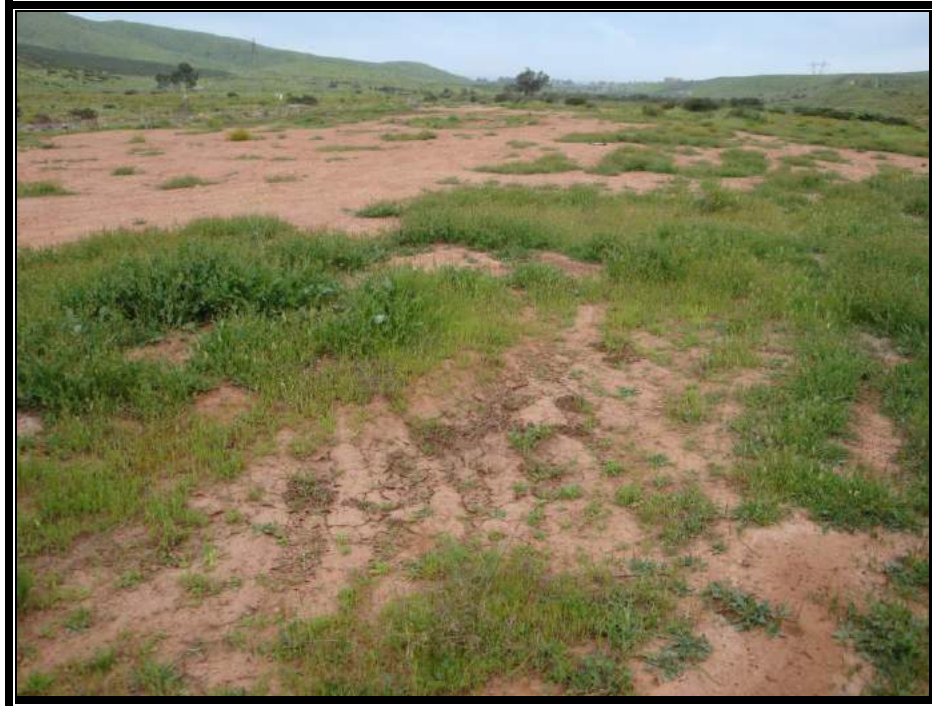
Proctor Valley ORV Site A EMP grant Project site damaged vernal pool before (above) and after (below) restoration.