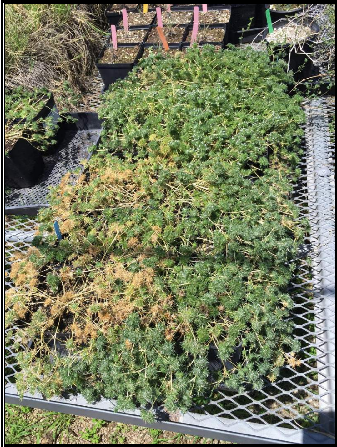
Spreading navarretia under propagation for seed bulking by Rancho Santa Ana Botanic Garden.