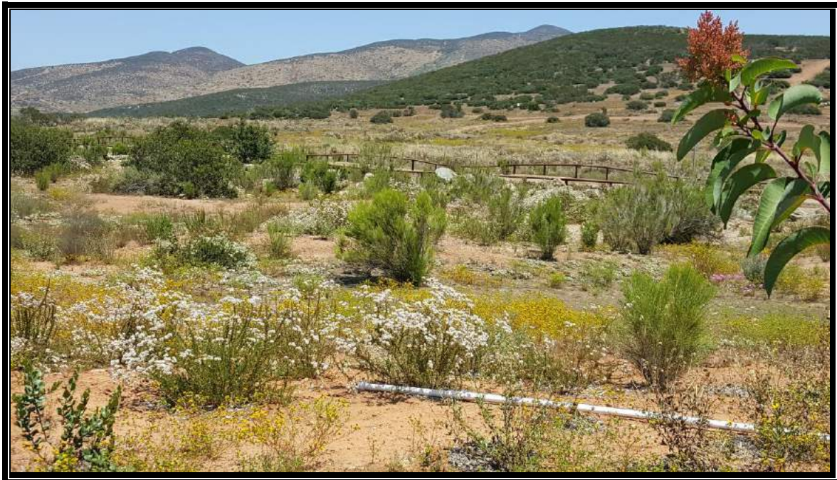
Proctor Valley ORV Site A EMP grant Project site vibrant coastal sage scrub upland vegetation after restoration.