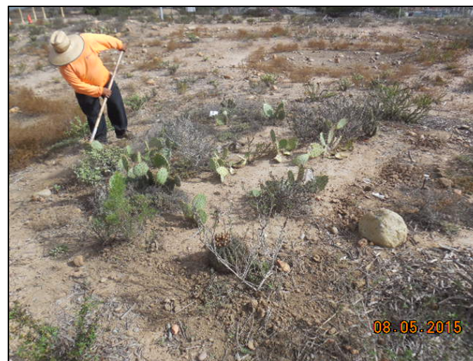
Photo 18. Site maintenance activities, August 2016.