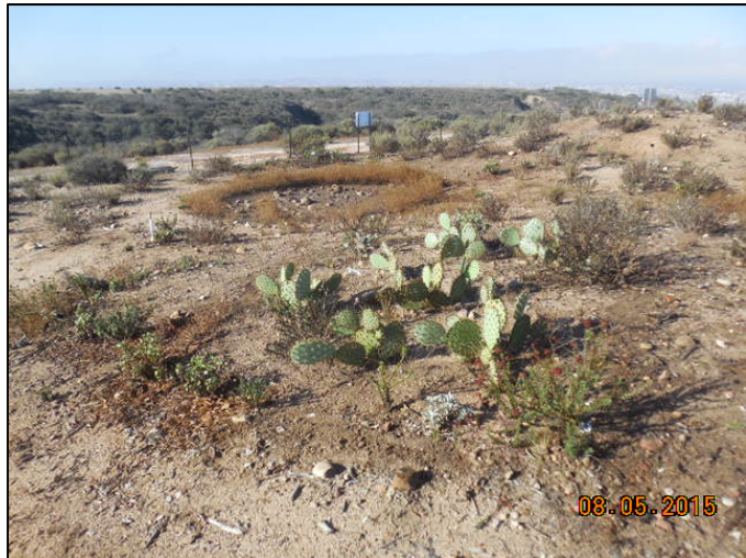
Photo 19. Vernal pools and upland habitat in summer dormancy, August 2016.