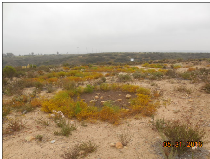
Photo 11. Southeastern portion of restoration site, May 2016.