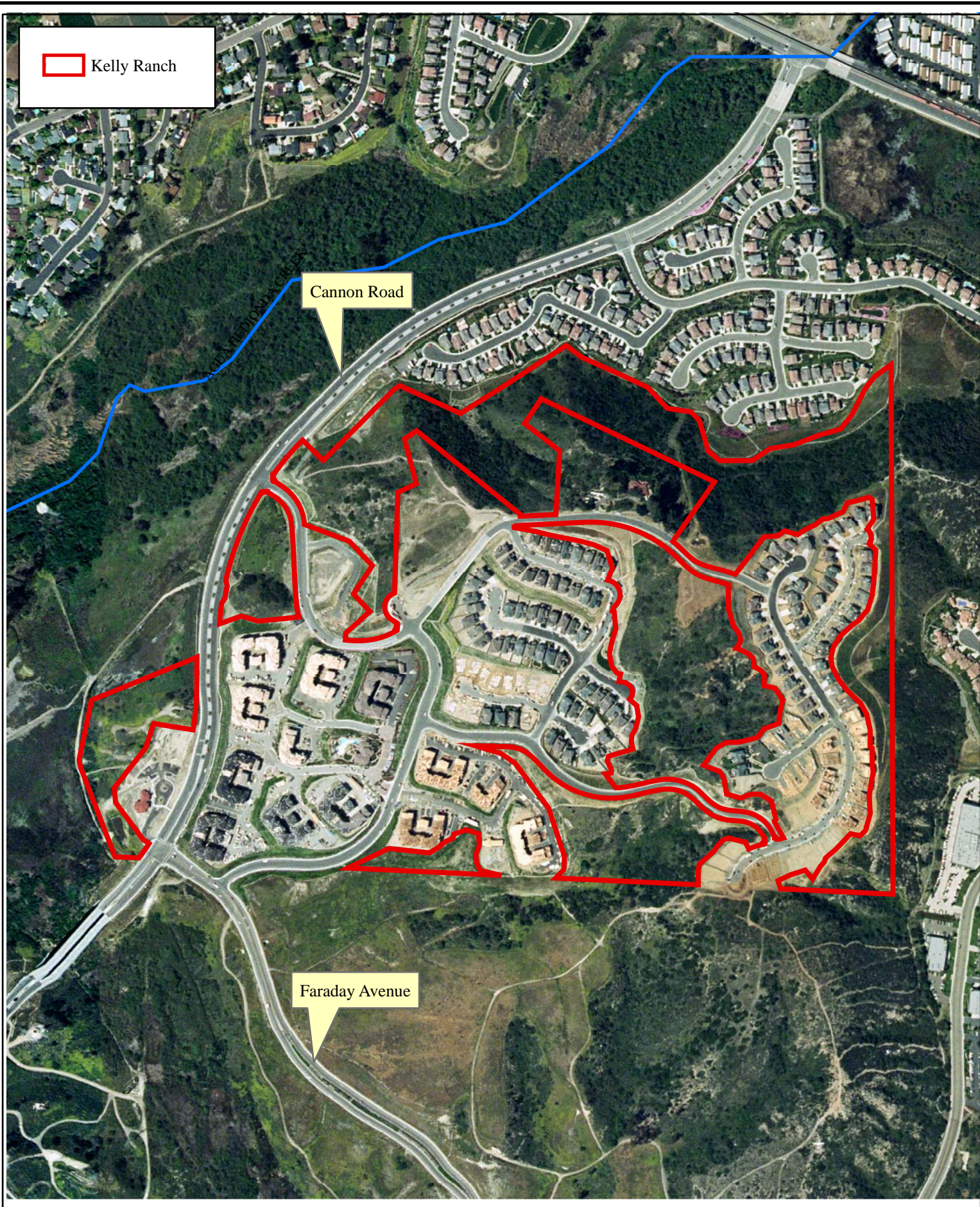
Figure 2 Preserve Location Kelly Ranch Habitat Conservation Area - Carlsbad, CA